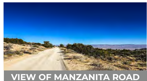
VIEW OF MANZANITA ROAD