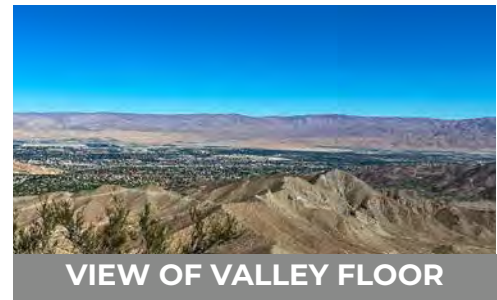
VIEW OF VALLEY FLOOR