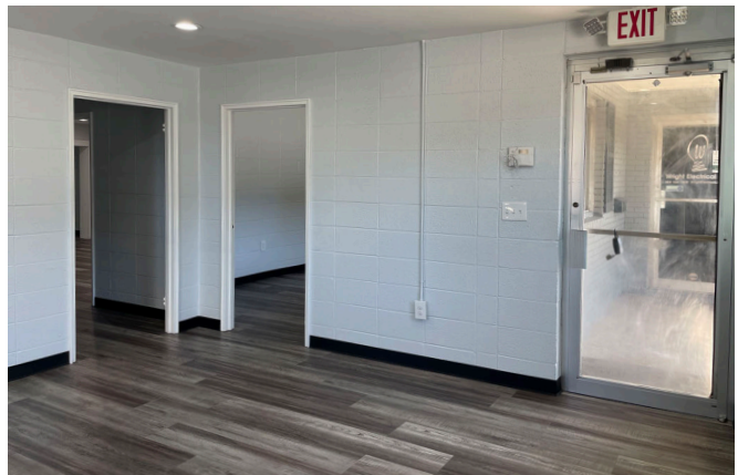
GREENVILLE COUNTY TAX MAP NO.M015030100601

Minutes from downtown Greenville and access to I-85, 385