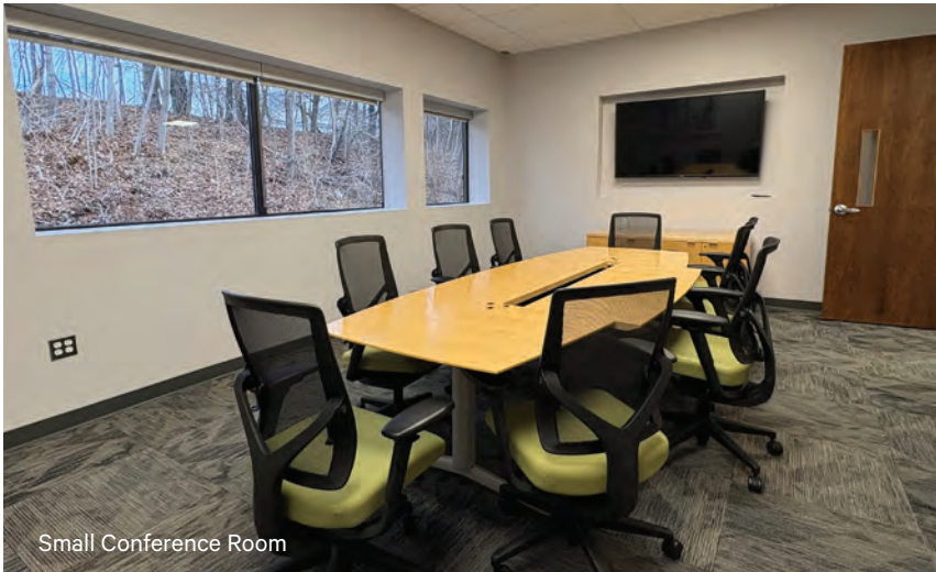
Small Conference Room