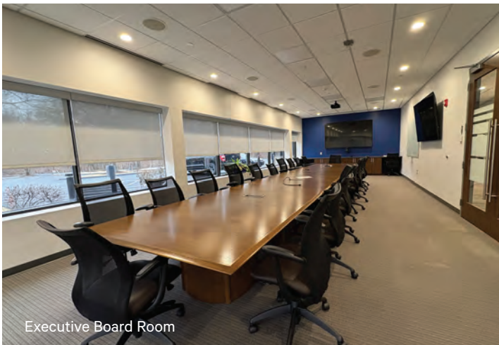
Executive Board Room

Existing buildout includes reception/lobby, a combination of both perimeter and interior private offices, conference/meeting areas, mens and womens restrooms, large open work space, and access to shared fitness center facilities with lockers and showers and kitchen/cafe.