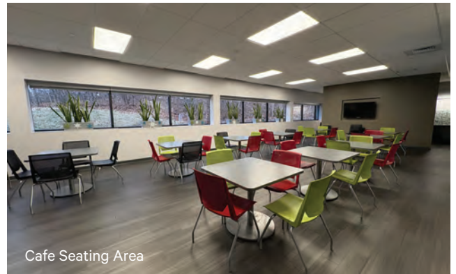
Cafe Seating Area