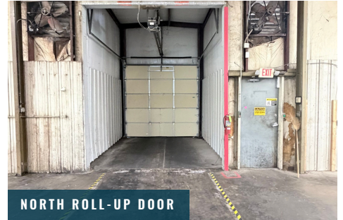
NORTH ROLL-UP DOOR