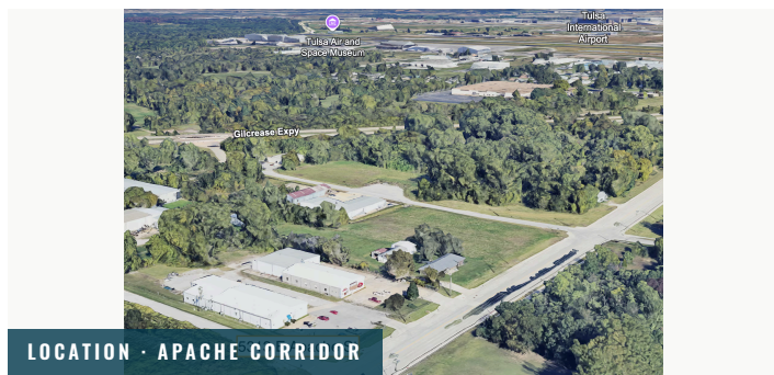
LOCATION · APACHE CORRIDOR