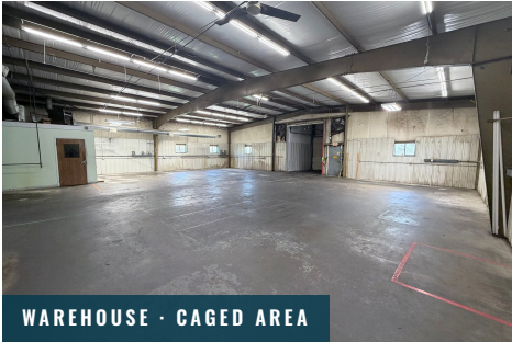
WAREHOUSE · CAGED AREA