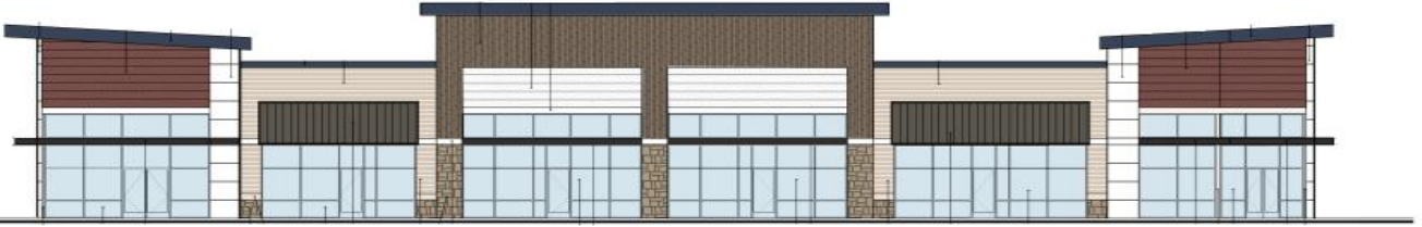
1 FRONT (NORTH) ELEVATION SCALE: 1/8"=1'-0"