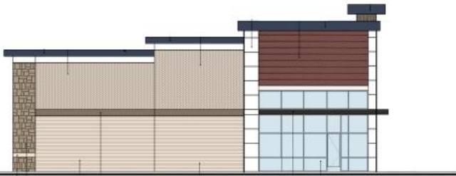
3 SIDE (EAST) ELEVATION SCALE: 1/8"=1'-0"