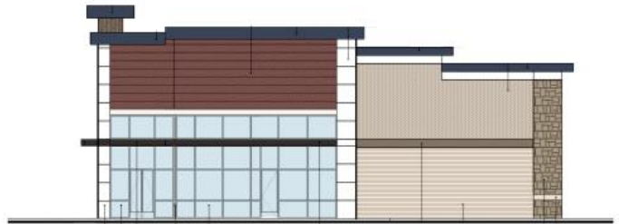
2 SIDE (WEST) ELEVATION SCALE: 1/8"=1'-0"