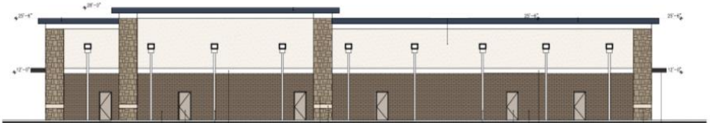
4 REAR (SOUTH) ELEVATION SCALE: 1/8"=1'-0"