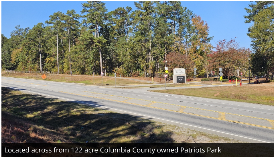
Located across from 122 acre Columbia County owned Patriots Park