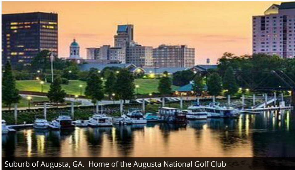
Suburb of Augusta, GA. Home of the Augusta National Golf Club