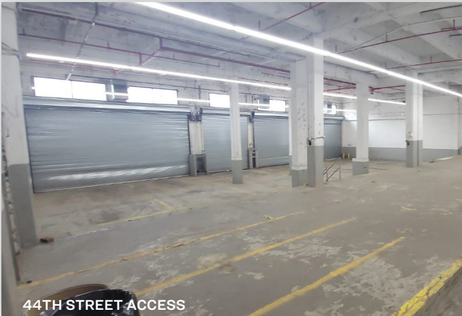
44TH STREET ACCESS