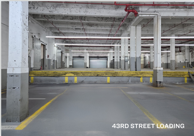
43RD STREET LOADING