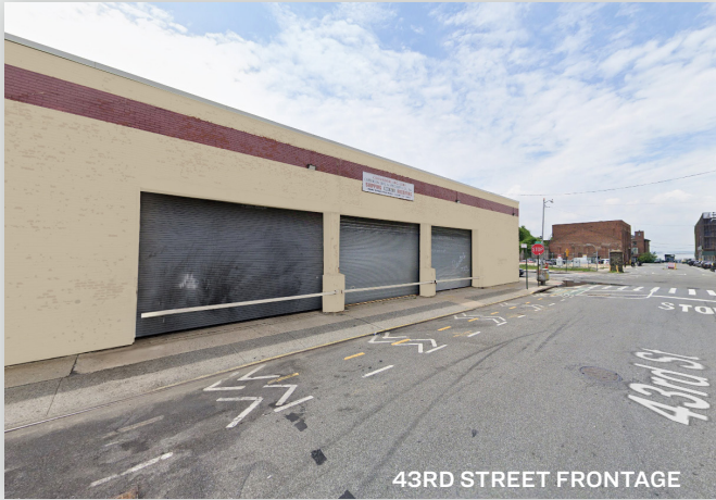
43RD STREET FRONTAGE