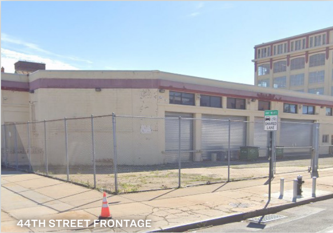
44TH STREET FRONTAGE