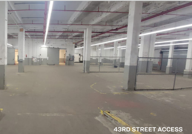
43RD STREET ACCESS