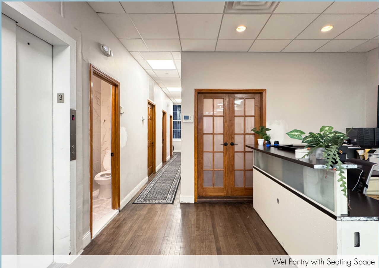
Wet Pantry with Seating Space