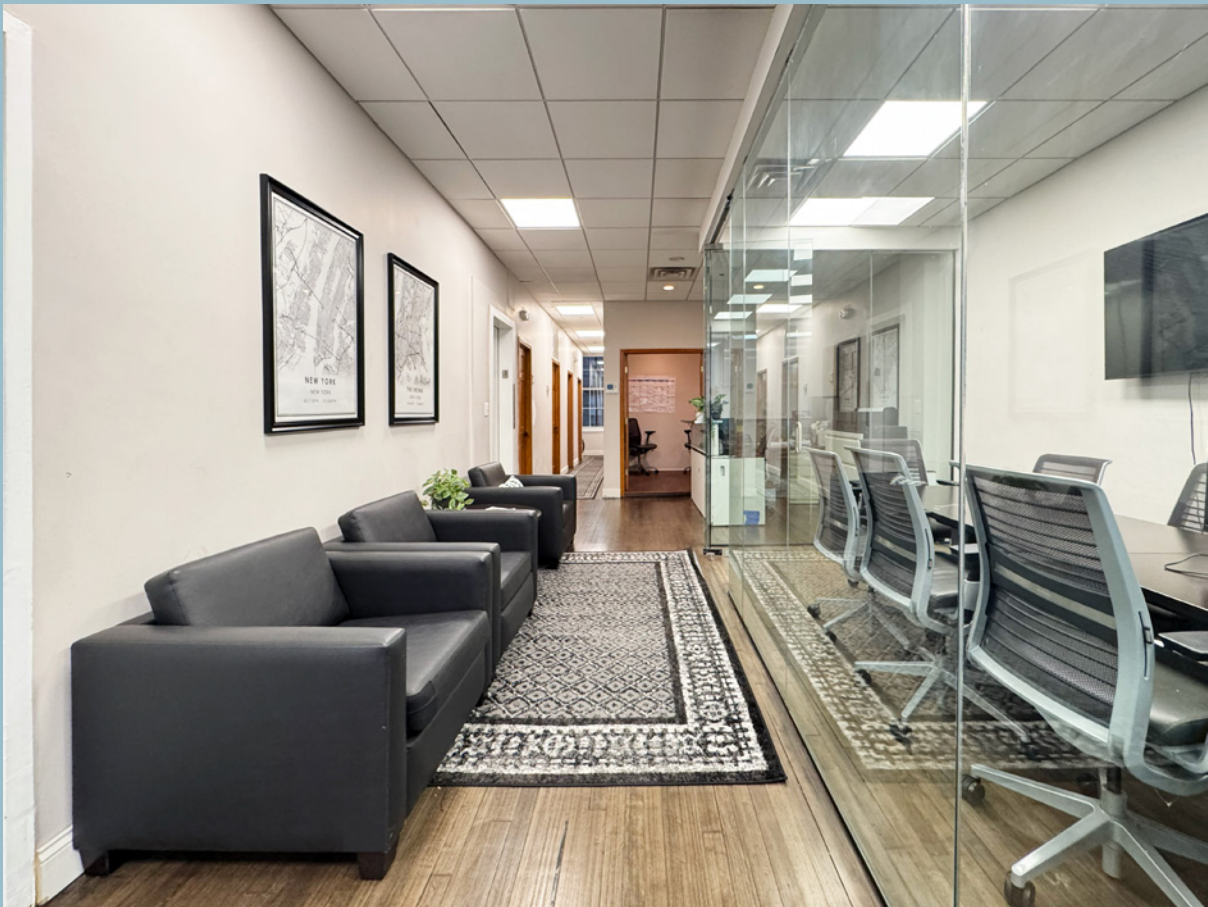
Furniture shown for layout concept only