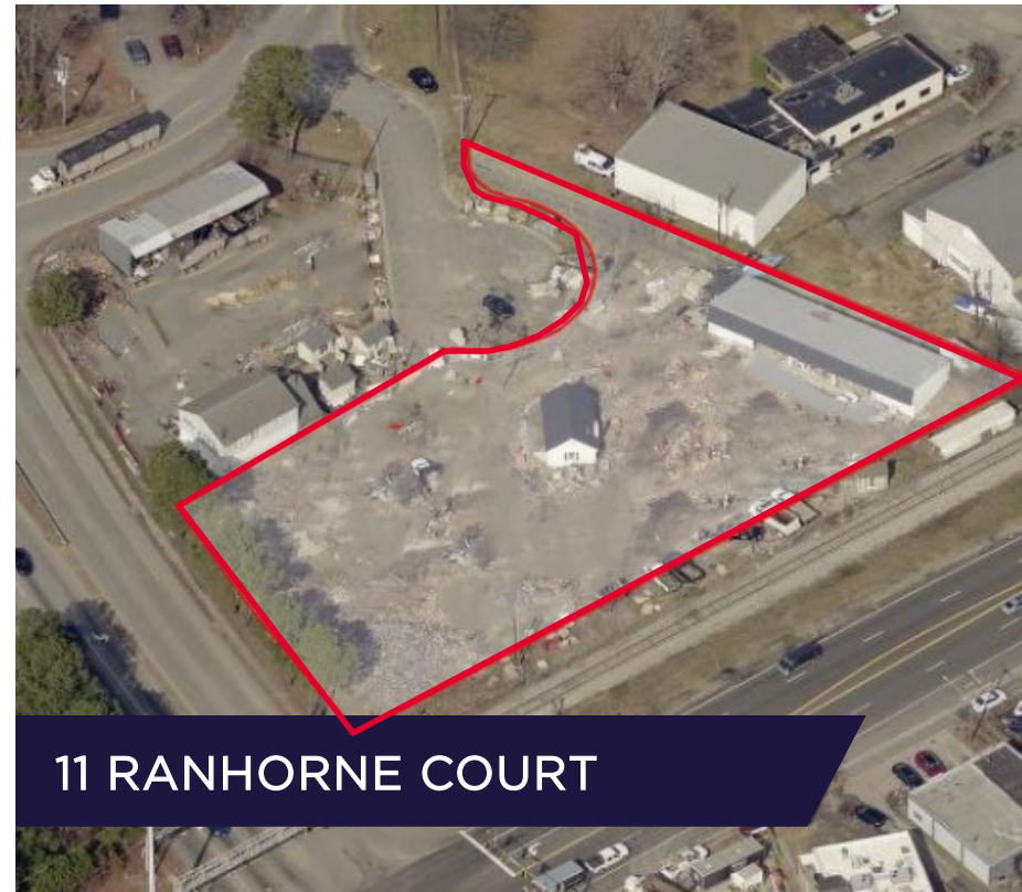
11 RANHORNE COURT