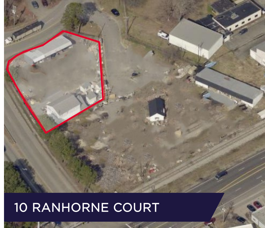
10 RANHORNE COURT

Rent: $3,000 / month, net of operating expenses TBD