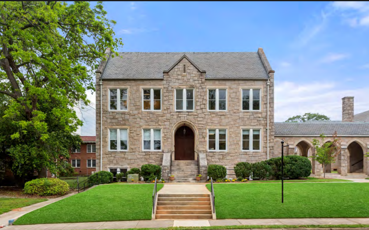
THE SYCAMORE BUILDING 312 Sycamore St, Decatur GA 30030