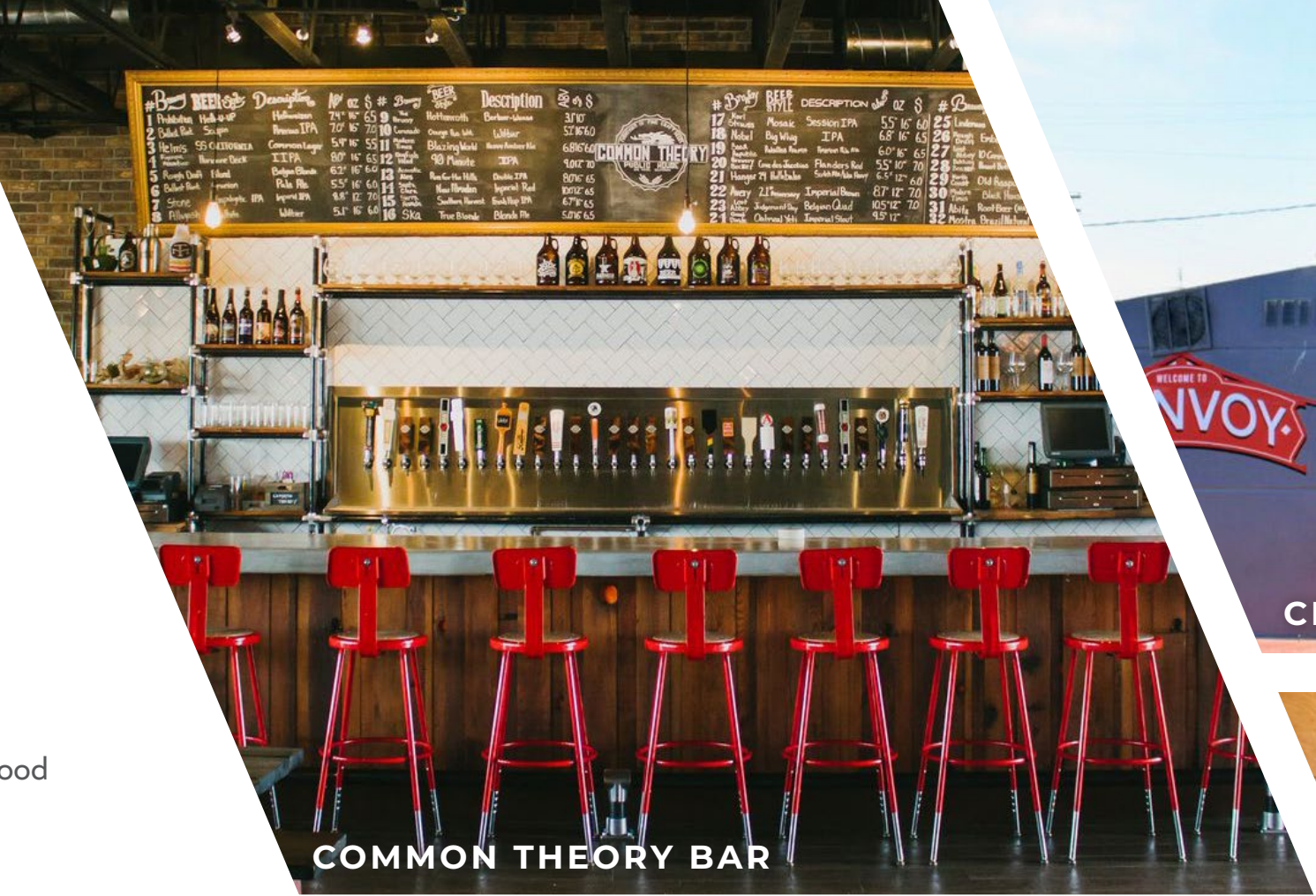
COMMON THEORY BAR

The information above has been obtained from sources believed to be reliable. While we do not doubt its accuracy, we have not verified it and make no guarantee, warranty or representation about it. It is your responsibility to independently confirm its accuracy and completeness. Any projections, opinions, assumptions or estimates used are for example only and do not represent the current or future performance of the property. The value of this transaction to you depends on tax and other factors which should be evaluated by your tax, financial and legal advisors. You and your advisors should conduct a careful, independent investigation of the property to determine to your satisfaction the suitability of the property for your needs.