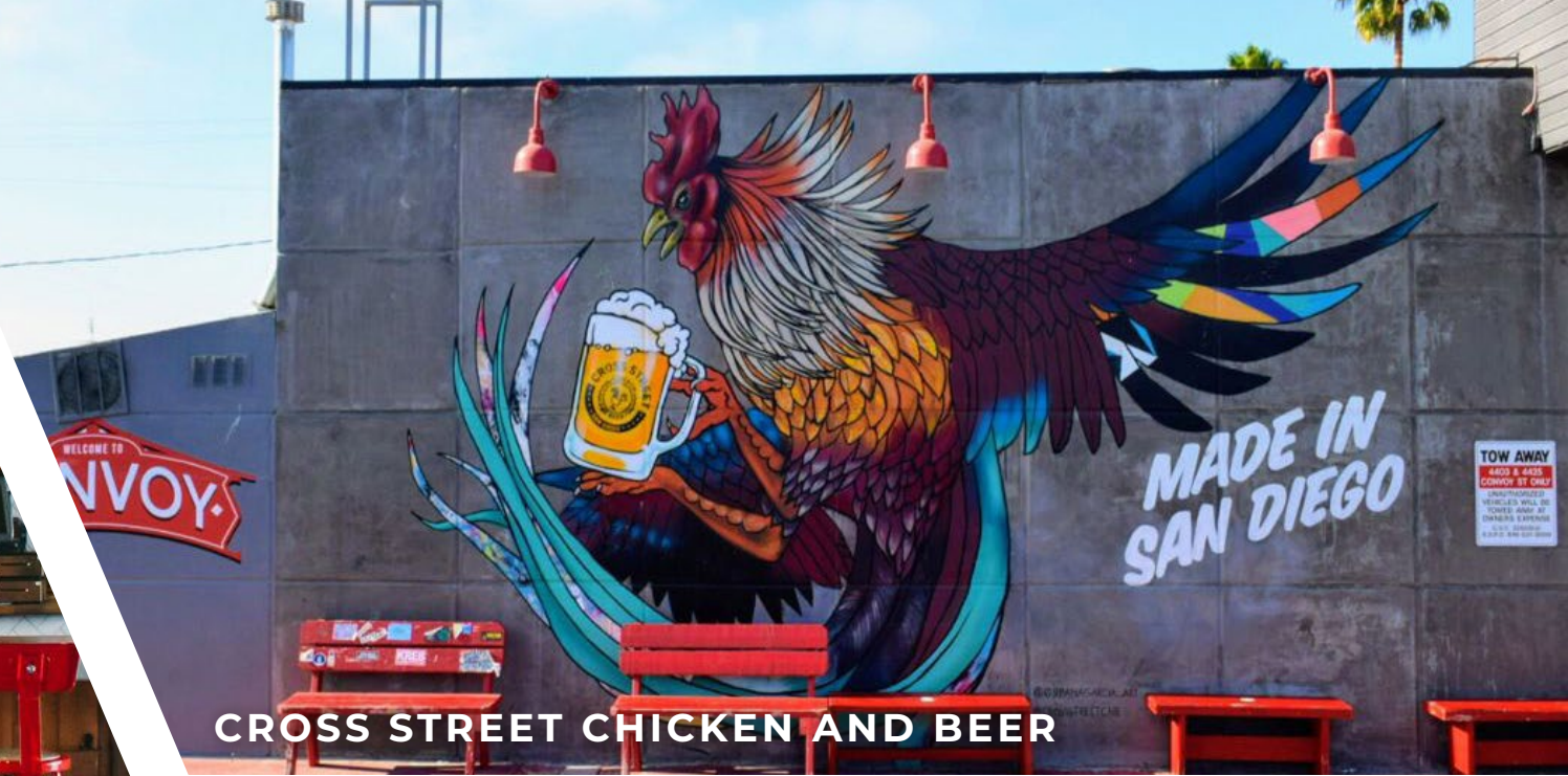
CROSS STREET CHICKEN AND BEER