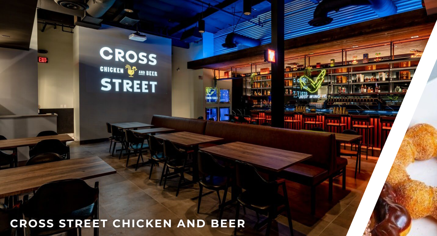
CROSS STREET CHICKEN AND BEER