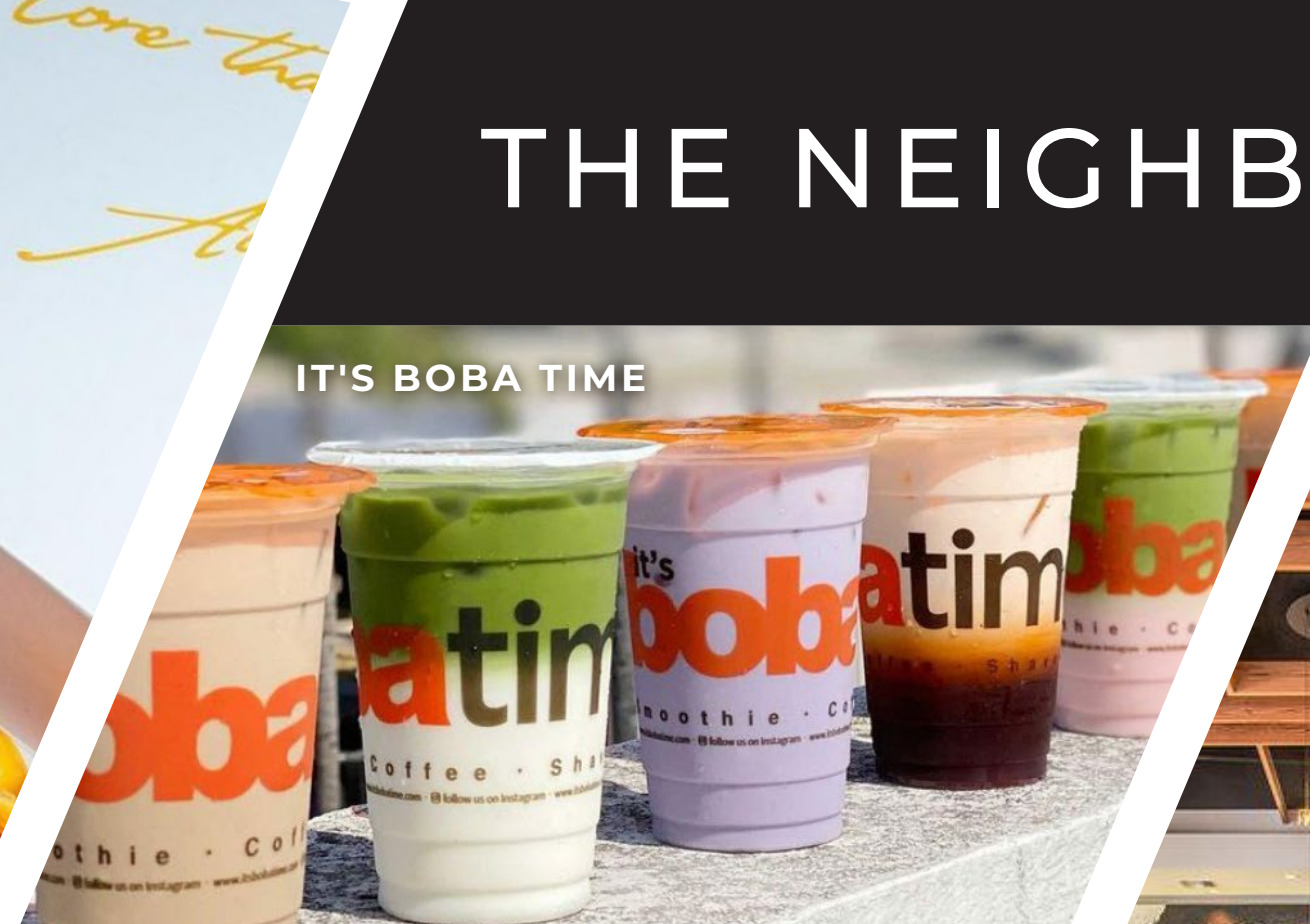
IT'S BOBA TIME