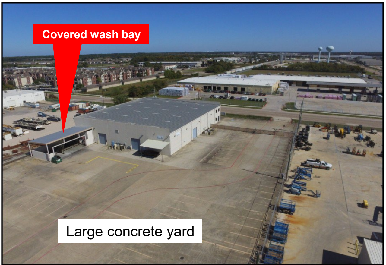
Covered wash bay