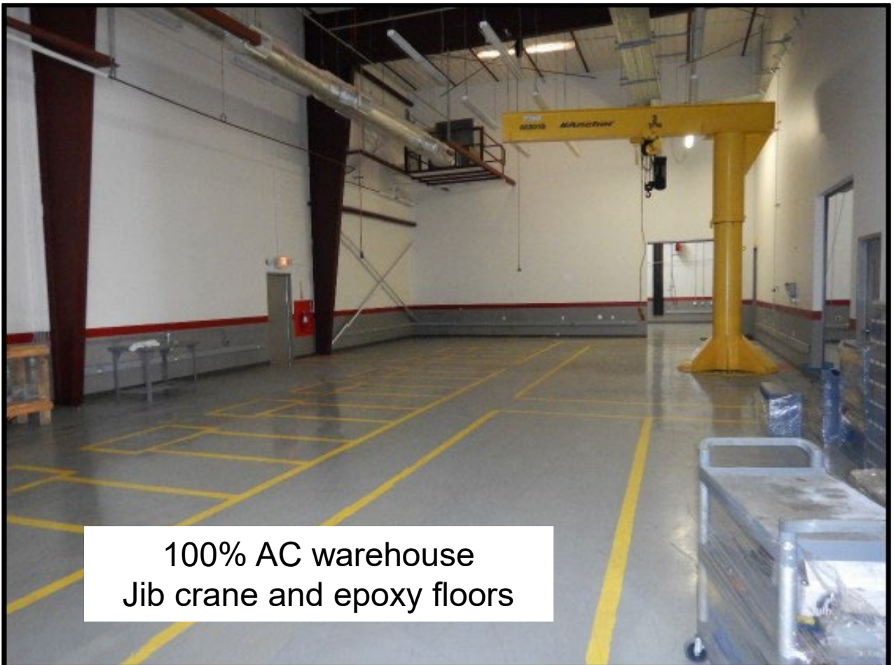
100% AC warehouse Jib crane and epoxy floors