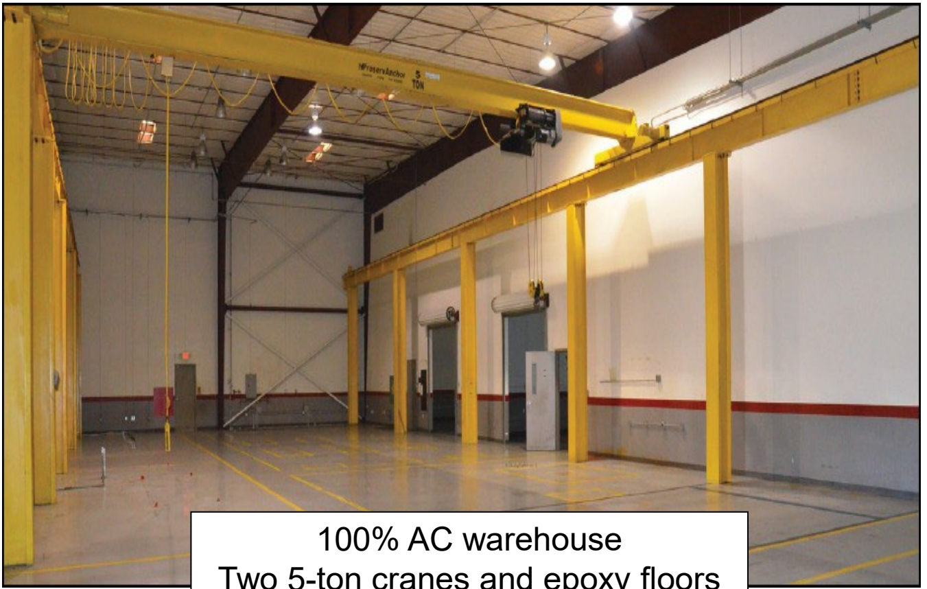
100% AC warehouse Two 5-ton cranes and epoxy floors