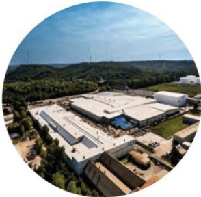
AAON 332,000 SQFT Headquarters