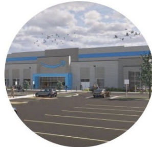
AMAZON FULFILLMENT 2.6-Million SQFT Facility