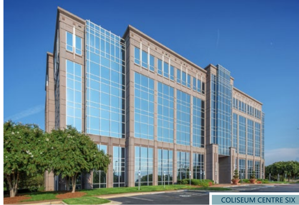
COLISEUM CENTRE SIX

Walking Distance to To Hotels, Restaurants & Retail