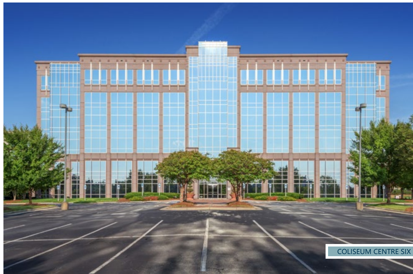
COLISEUM CENTRE SIX