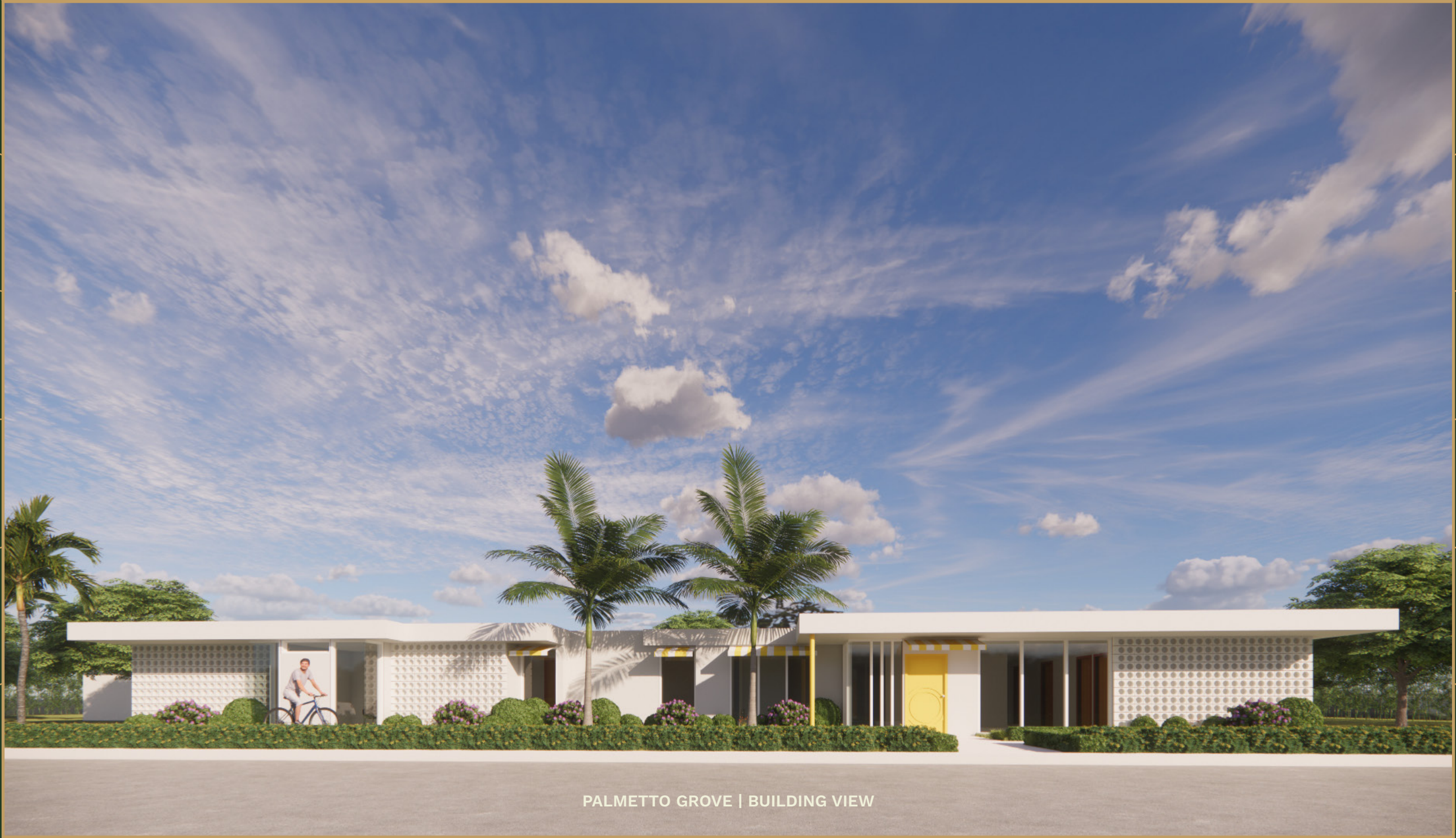
PALMETTO GROVE | BUILDING VIEW