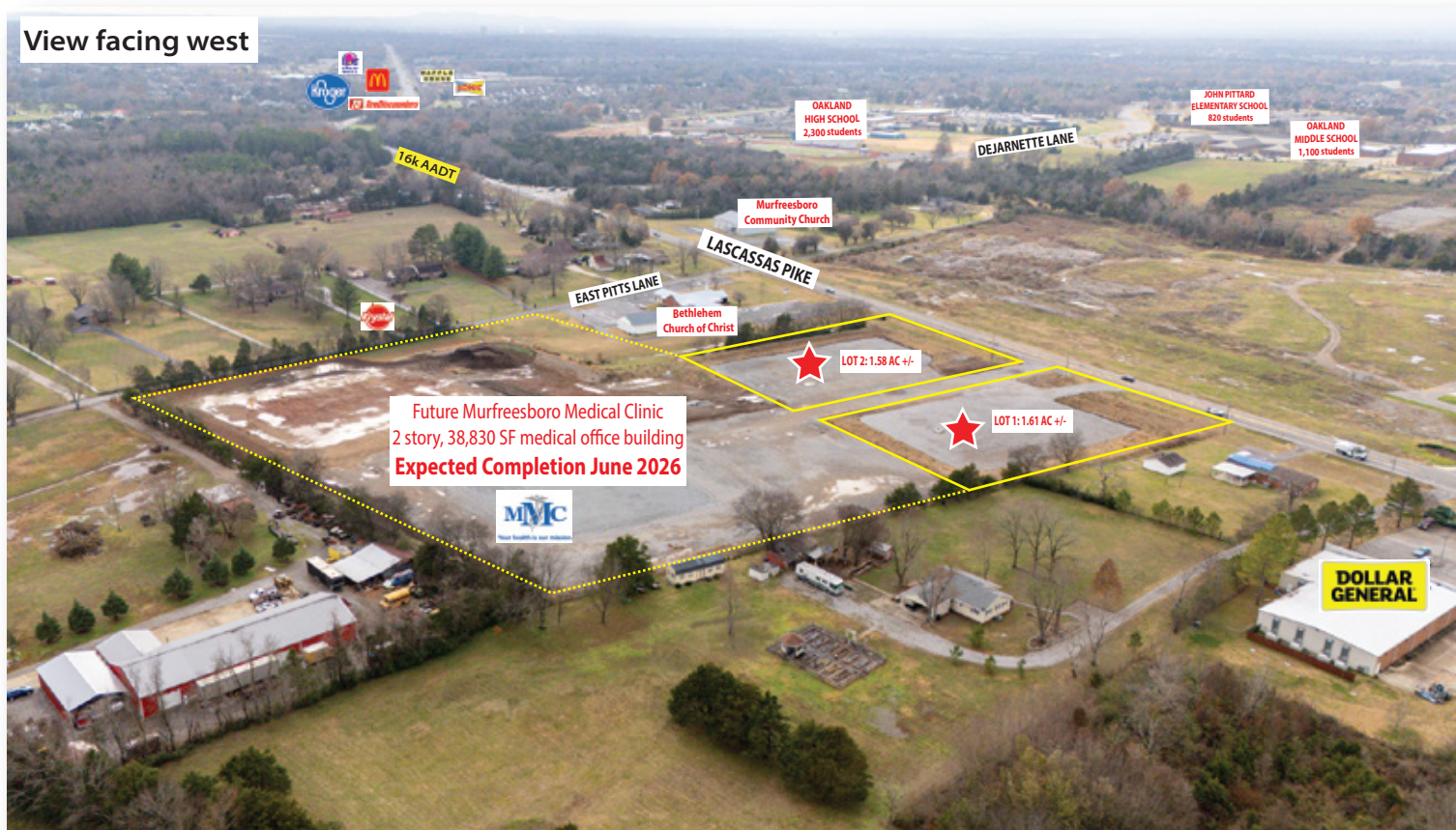
View facing west