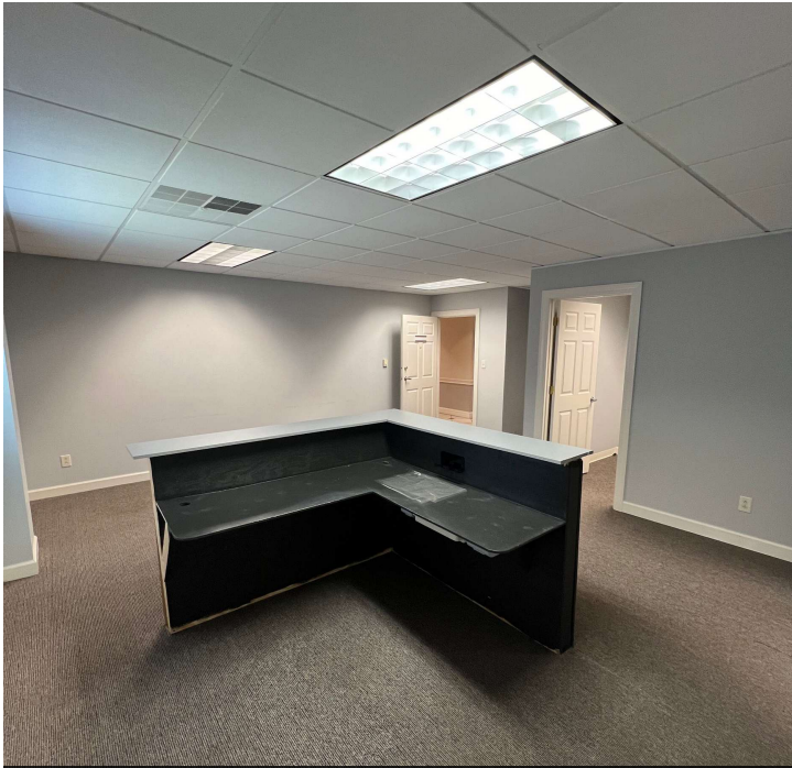
Waiting Area - Front Desk