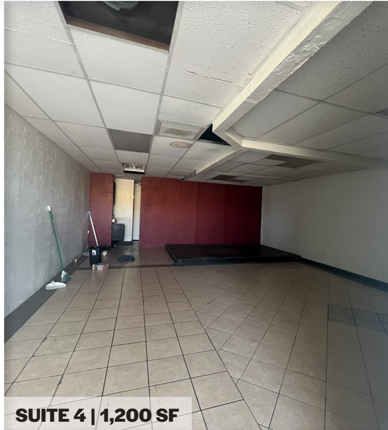
SUITE 4 | 1,200 SF