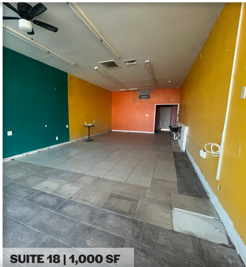
SUITE 18 | 1,000 SF