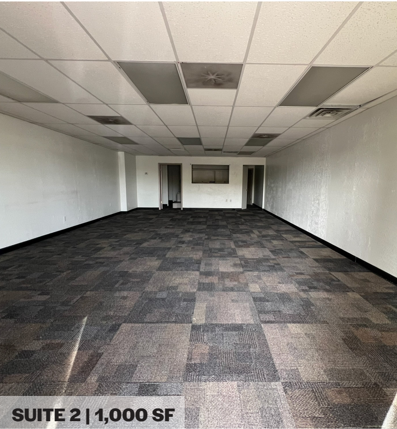
SUITE 2 | 1,000 SF