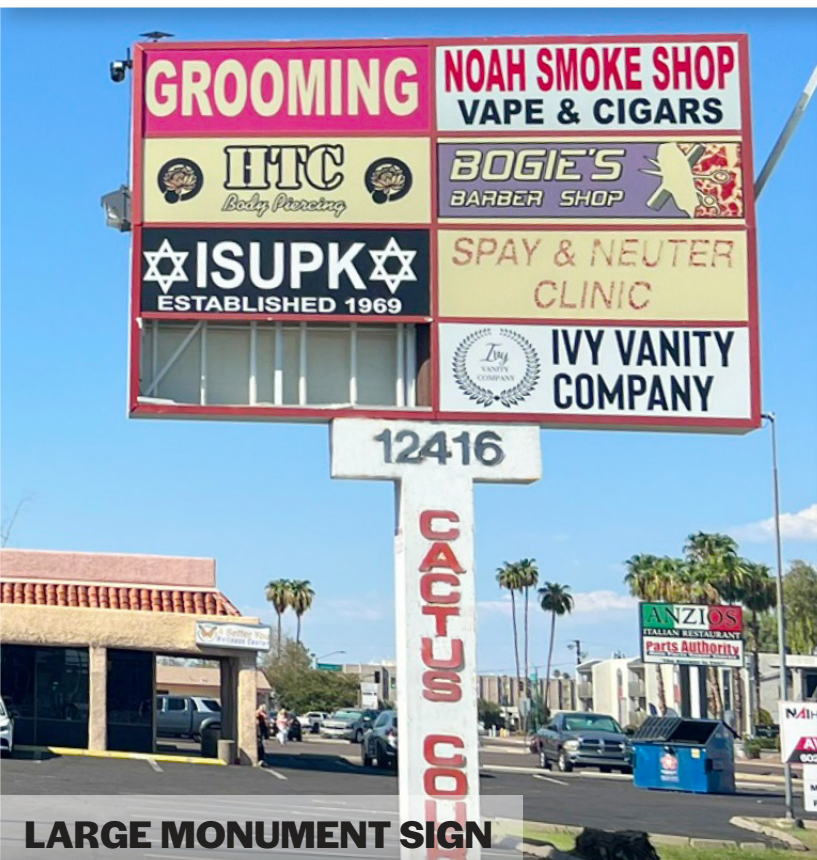
LARGE MONUMENT SIGN