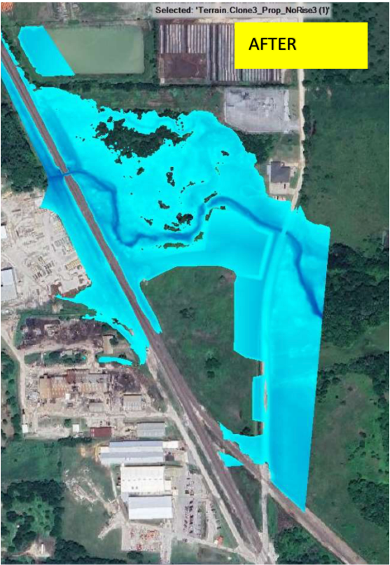
Figure 3-2: Proposed Floodplain Depth