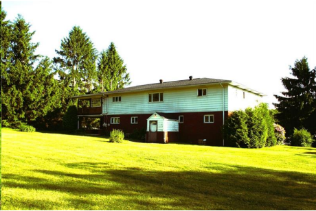
Back of Structure