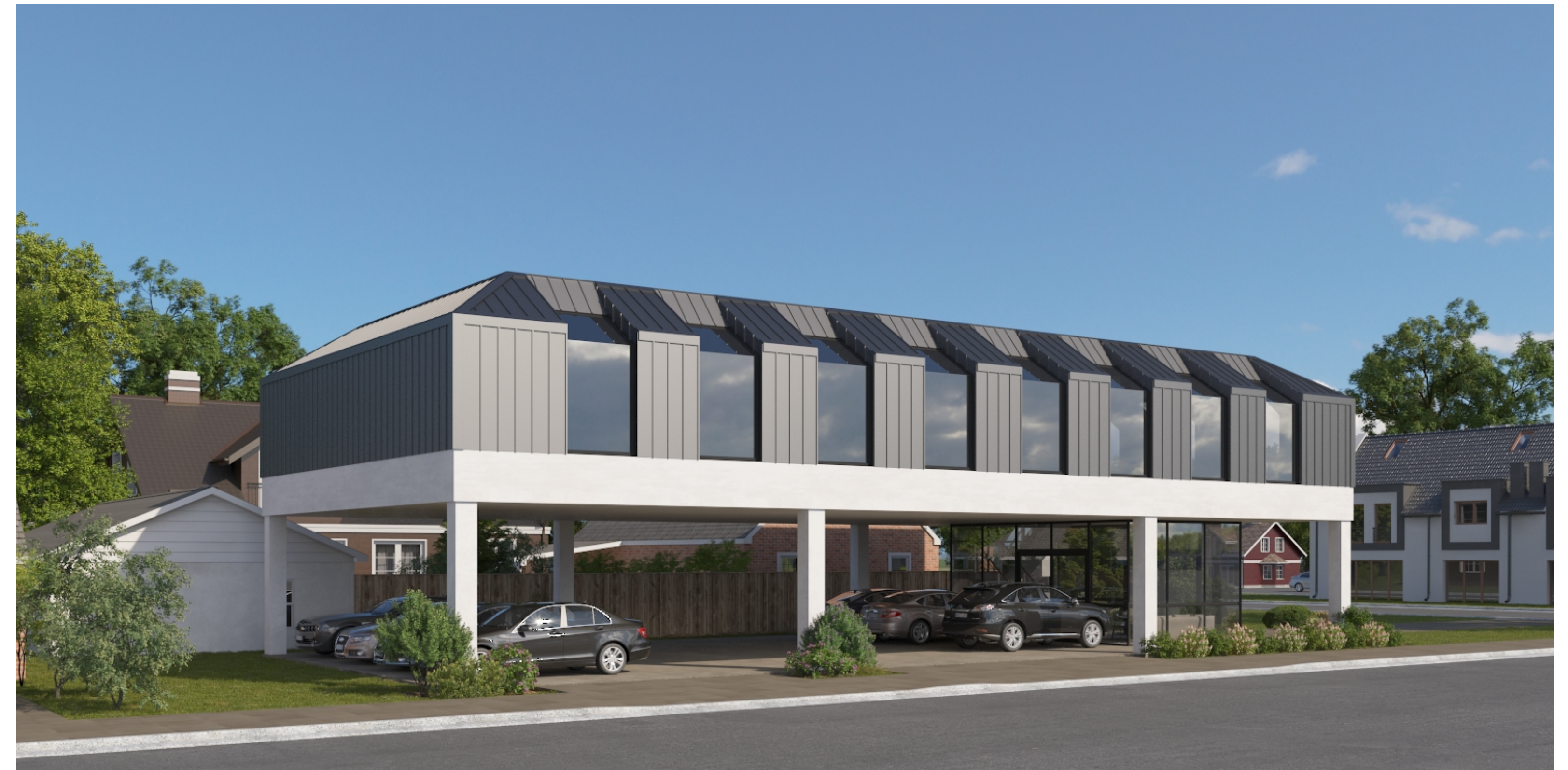
AXON - 3D PLAN