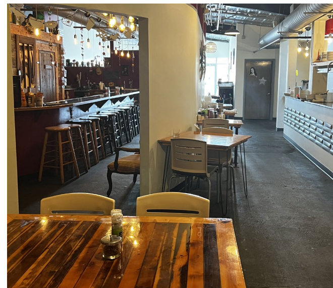
Private "Speakeasy" room