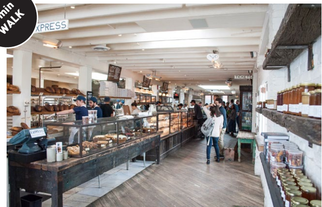
Gjusta: Gjusta is a bakery and deli known for its artisanal breads, pastries, and sandwiches. The rustic, industrial space adds to the charm, making it a popular spot for breakfast, lunch, and everything in between.