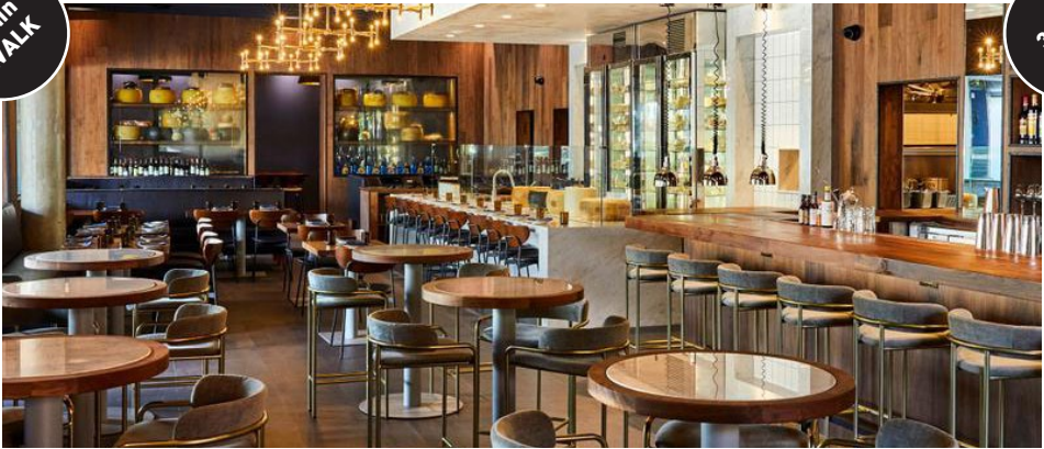
Forma Venice: Forma Venice is celebrated for its delicious pasta dishes and extensive cheese selection. The restaurant provides a warm and inviting atmosphere, perfect for enjoying a leisurely meal with friends or family.