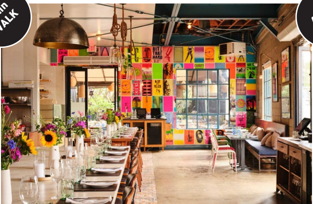
The Rose Venice: The Rose Venice offers a vibrant dining experience with a diverse menu that features fresh, seasonal ingredients. The spacious interior and outdoor patio make it an ideal spot for any meal of the day.