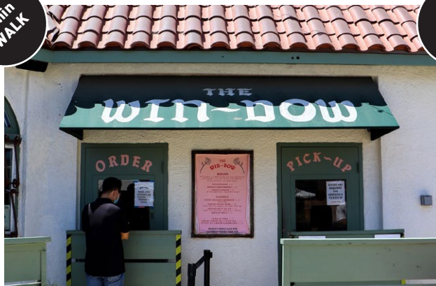
The Window at American Beauty: The Window at American Beauty serves up some of the best burgers in Venice. This casual eatery is perfect for a quick, tasty meal on the go, with a menu that also includes fries, salads, and other comfort food favorites.