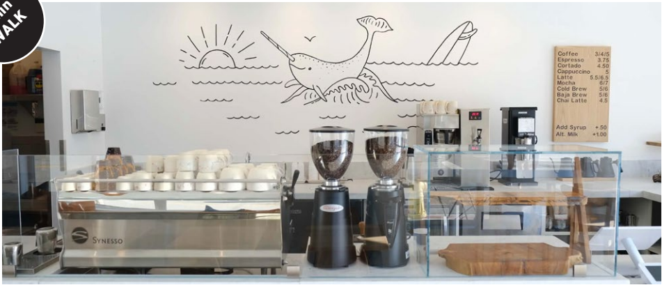
Gnarwhal Coffee: Gnarwhal Coffee is a cozy spot known for its quality brews and friendly atmosphere. It's the perfect place to grab a coffee and relax, whether you're starting your day or taking a break.