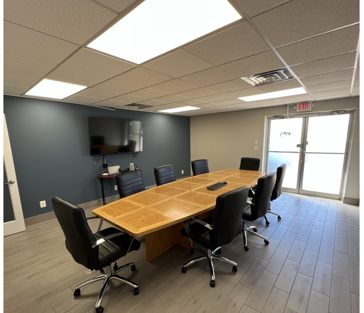
Conference Room 1