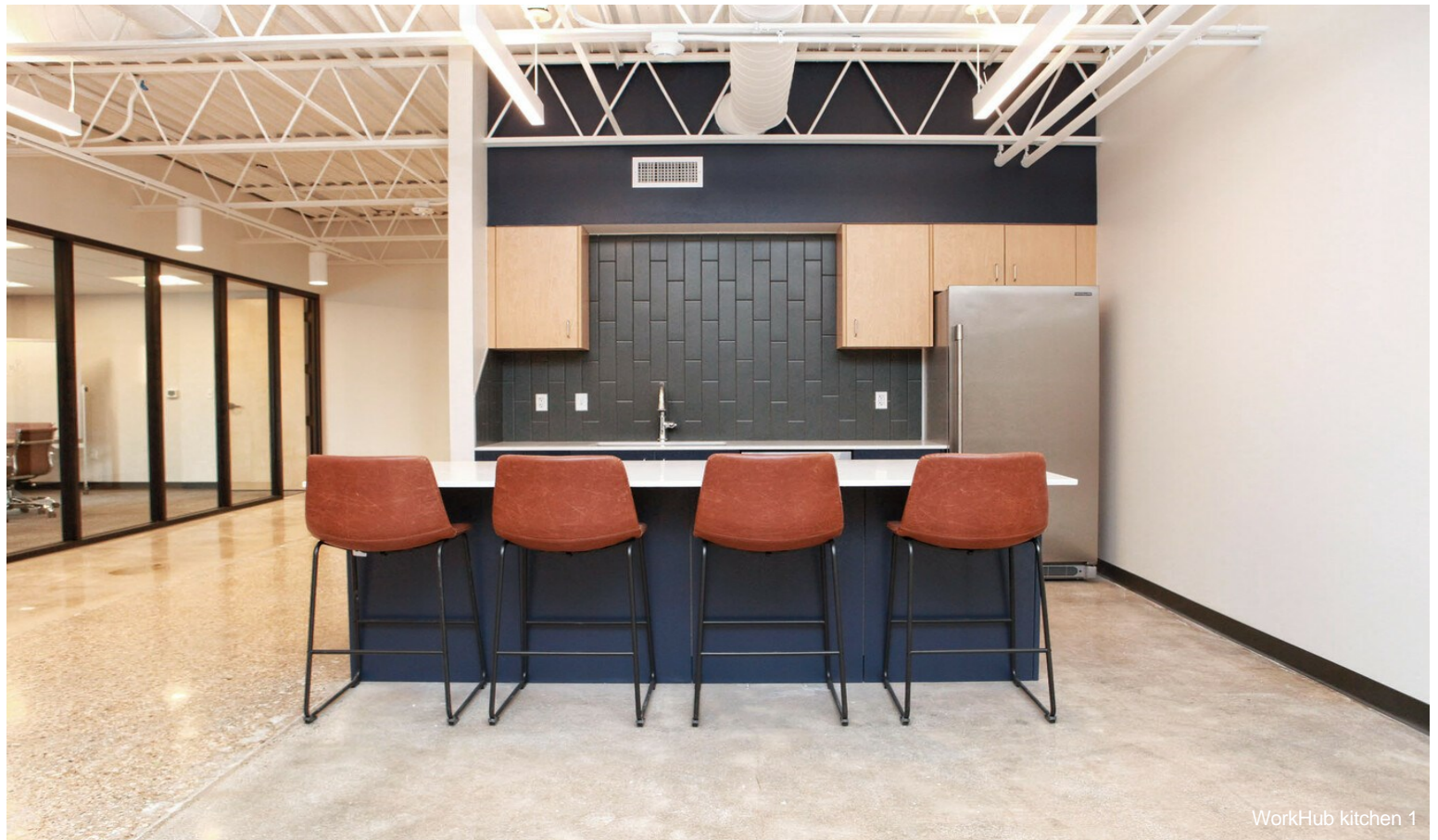
WorkHub kitchen 1