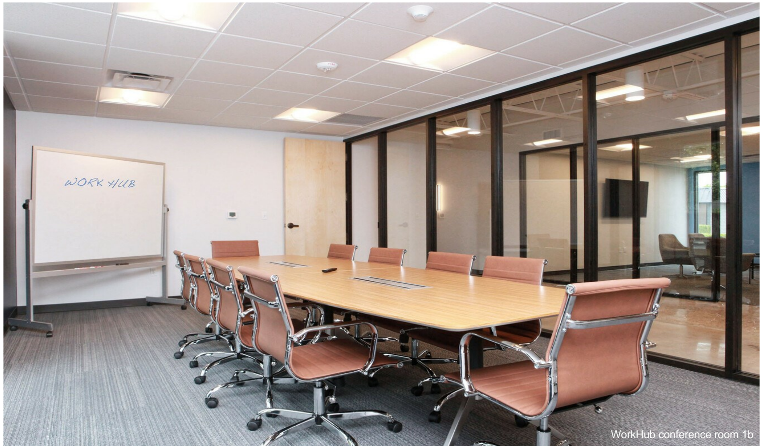
WorkHub conference room 1b