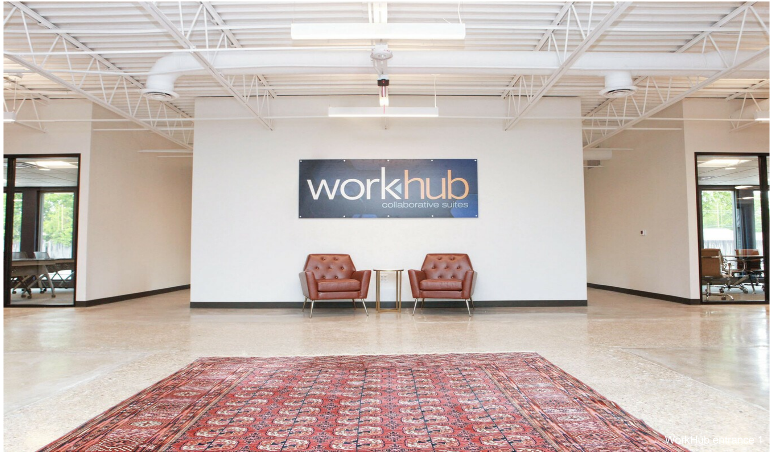
WorkHub entrance 1