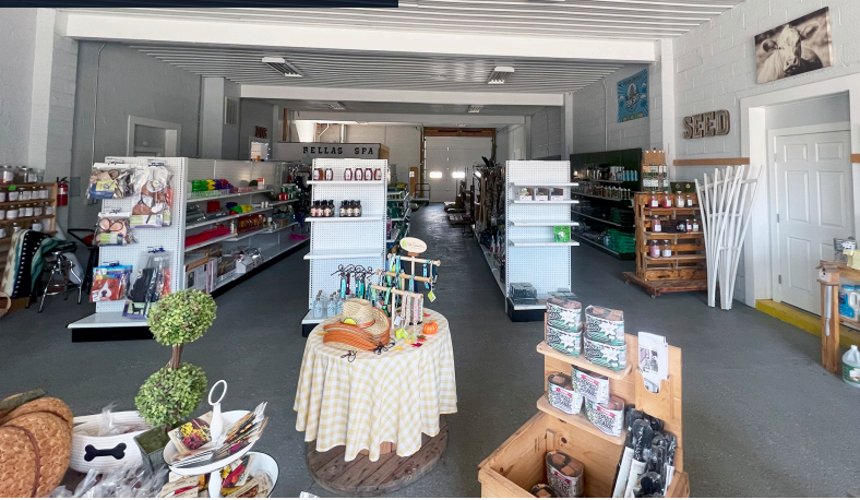
UNIT C - 3,000± SF