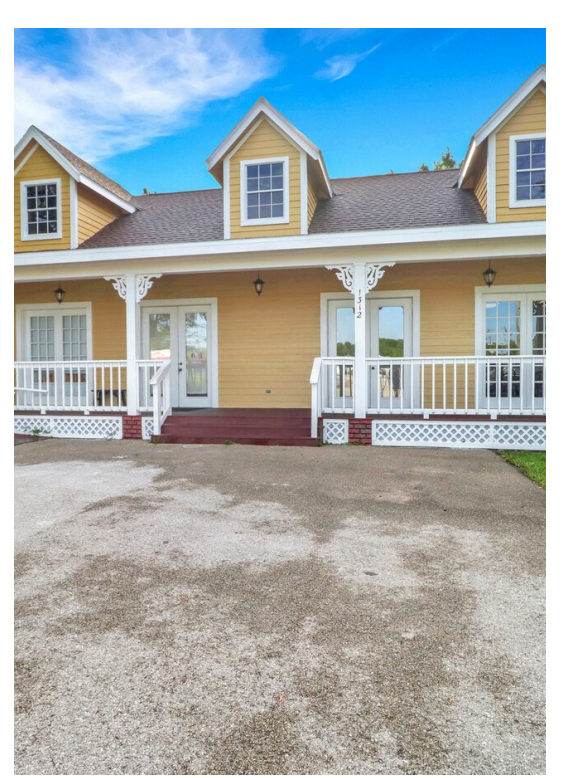
1312 15th St N