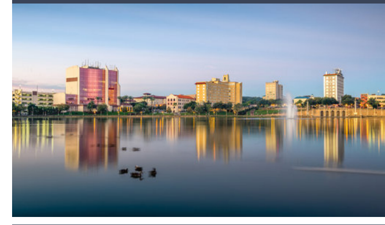
"By 2030, Polk County's Population is expected to increase by 20%" - Fox 13 News