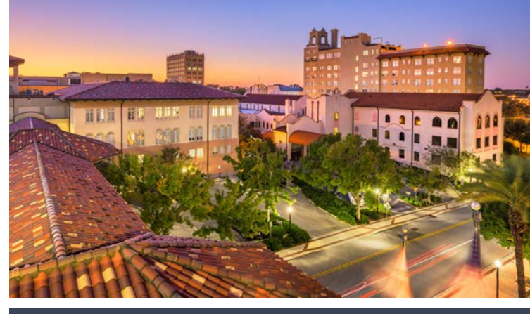
"Number 3 'Boomtown' in the Country" - WUSF

"One of the fastest growing citites in the United States" - Bay News 9