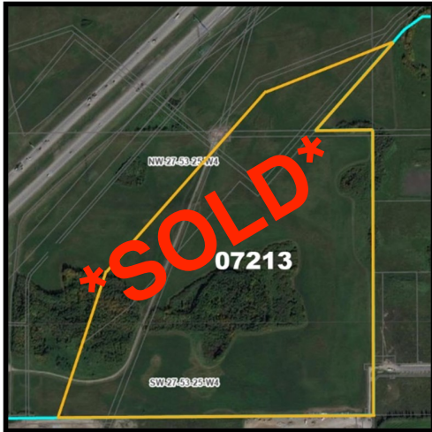
14490 164 Street NW