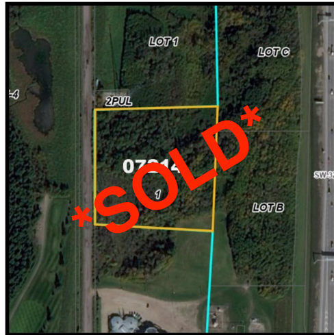
9347 199 Street NW