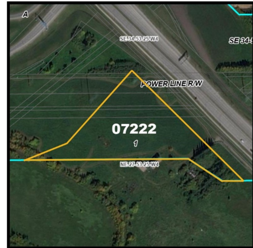
15320 Mark Messier Trail NW