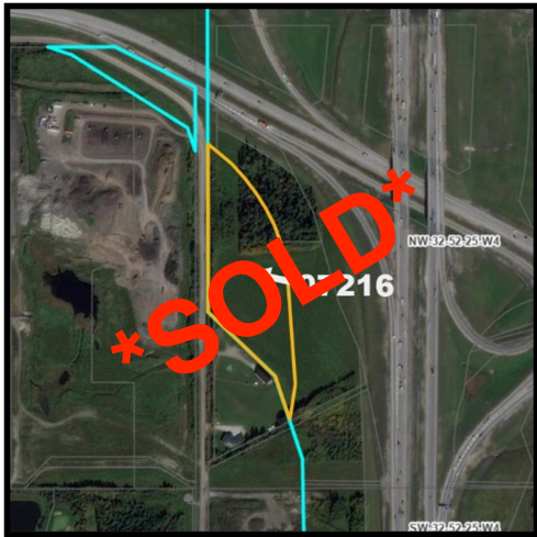
9775 199 Street NW