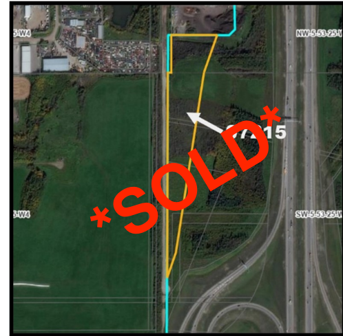
10345 199 Street NW