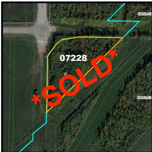
14490 184 Street NW