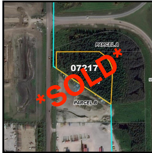
10823 199 Street NW