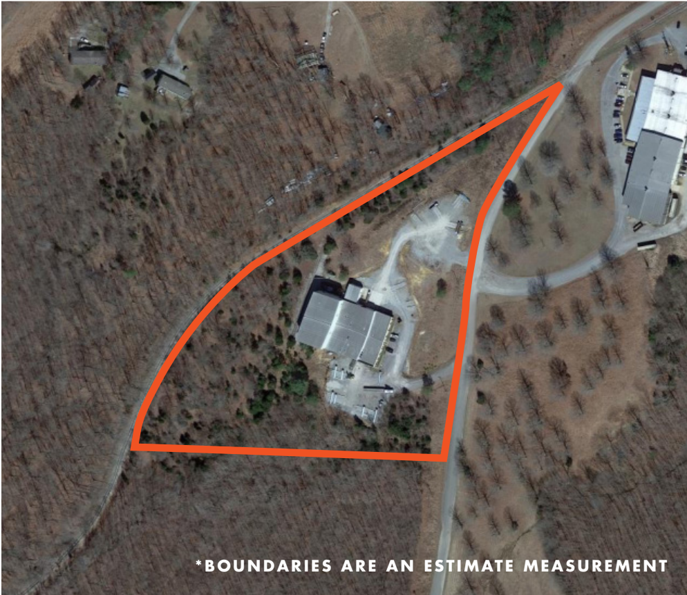
*BOUNDARIES ARE AN ESTIMATE MEASUREMENT