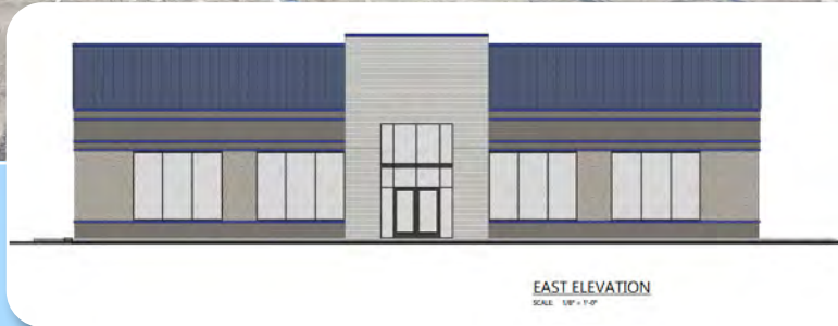
EAST ELEVATION SCALE 1/8"=1'-0"