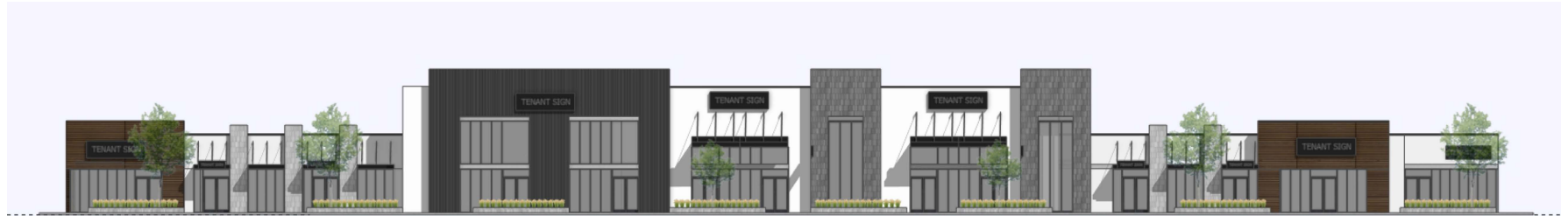
Alameda Retail Concept - Pocatello, ID