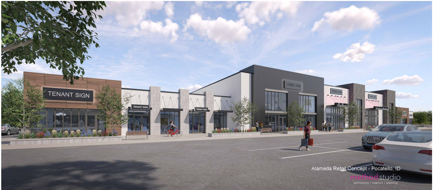
Alameda Retail Concept - Pocatello, ID

methodstudio architecture | interiors | planning