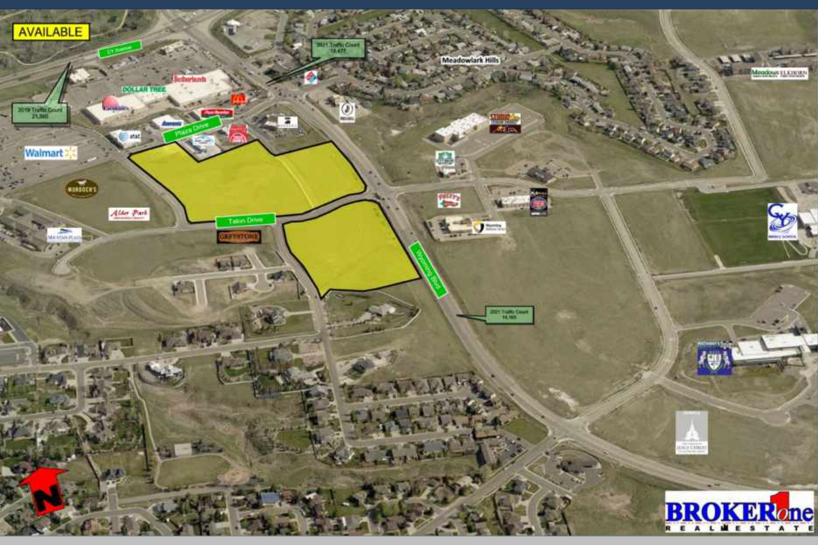
© 2022 BrokerOne Real Estate, a Wyoming licensed real estate broker. The owners of BrokerOne Real Estate are members of the entity that owns portions of the property described in this Offering Memorandum.

This Offering Memorandum has been prepared by BrokerOne Real Estate for use by a limited number of parties and has been obtained from sources believed reliable. While we do not doubt its accuracy, we have not verified it, and make no guarantee, warranty or representation about it. It is your responsibility to confirm, independently, its accuracy and completeness. The Offering Memorandum does not constitute a representation that there has been no change in the business or affairs of the property or Owner since the date of preparation of the Offering Memorandum. Analysis and verification of the information contained herein is solely the responsibility of the prospective purchaser.