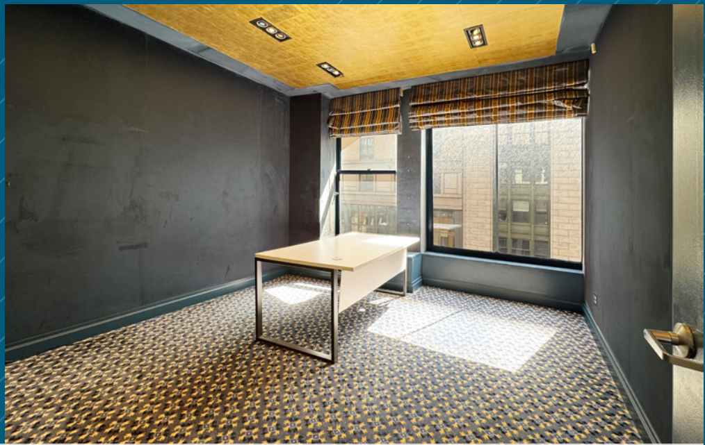
5th Floor Current Conditions