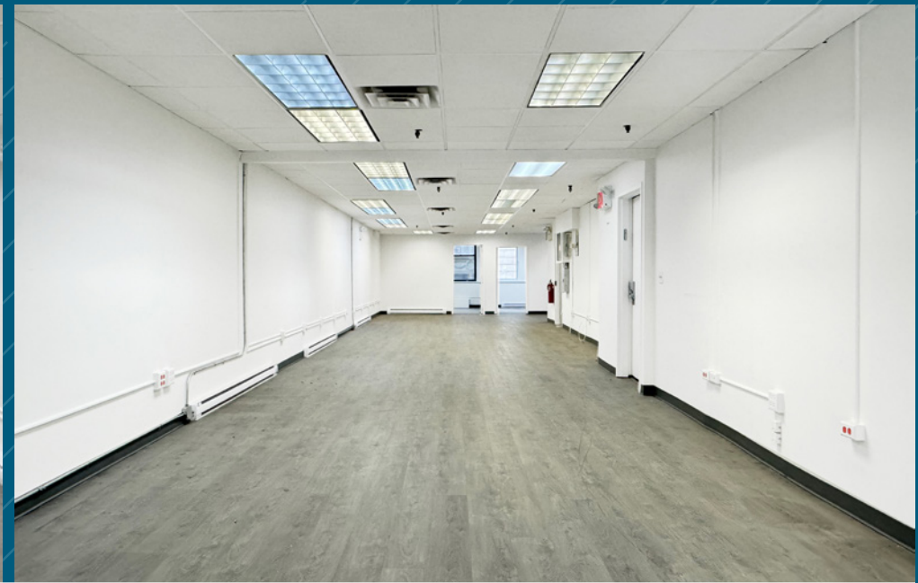
6th Floor - Current Conditions

ABS Partners Real Estate, as the exclusive agent is pleased to offer the following opportunity for sublease: