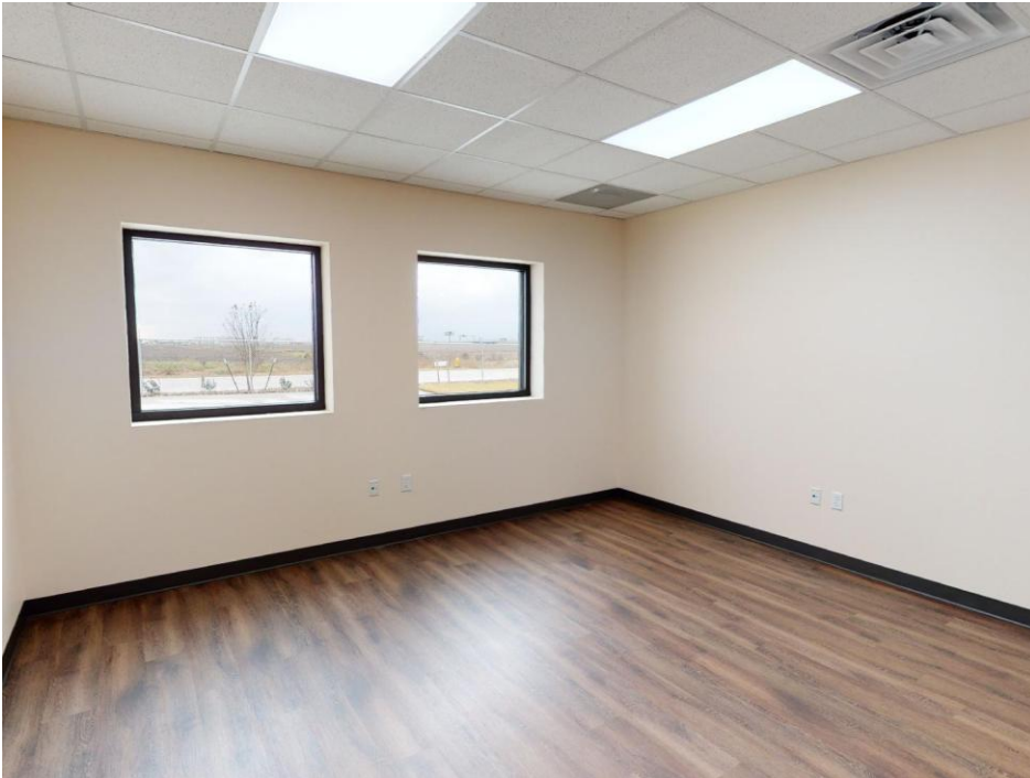
PHOTOS ARE REPRESENTATIVE OF PROPERTY PRIOR TO PREVIOUS TENANT.