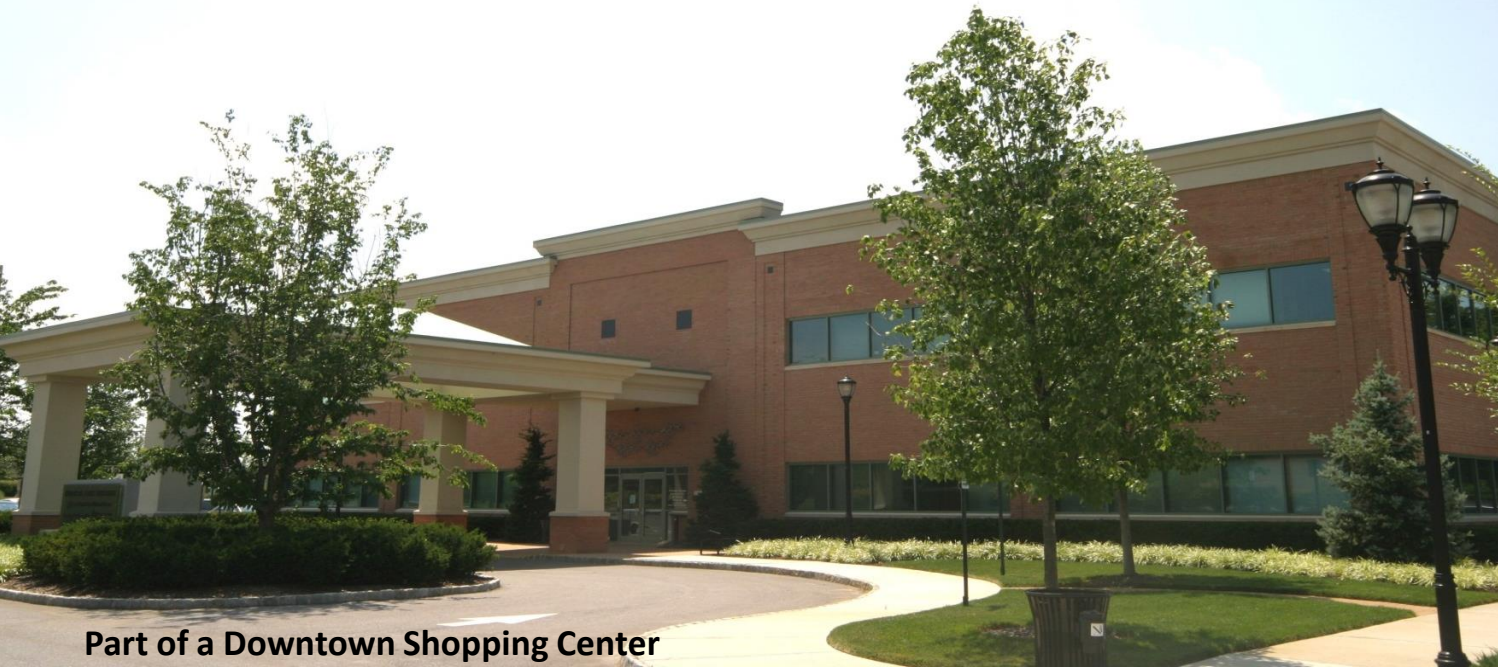
Part of a Downtown Shopping Center