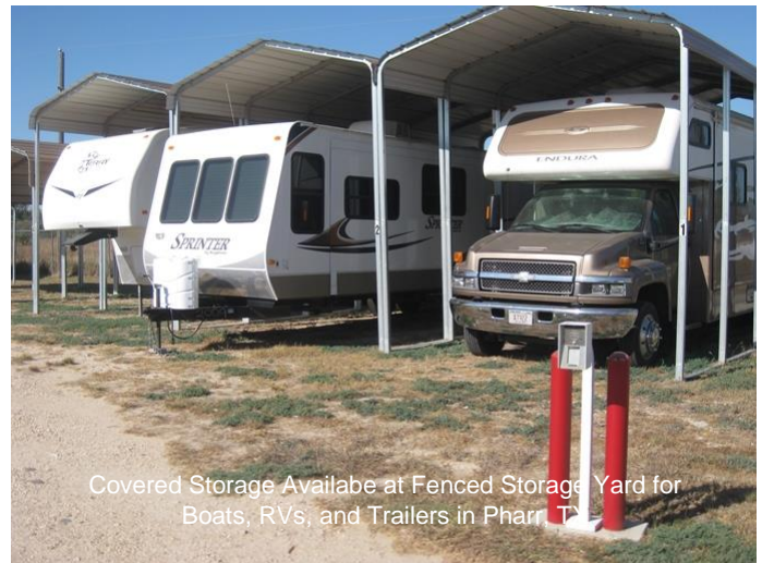
Covered Storage Available at Fenced Storage Yard for Boats, RVs, and Trailers in Pharr, TX