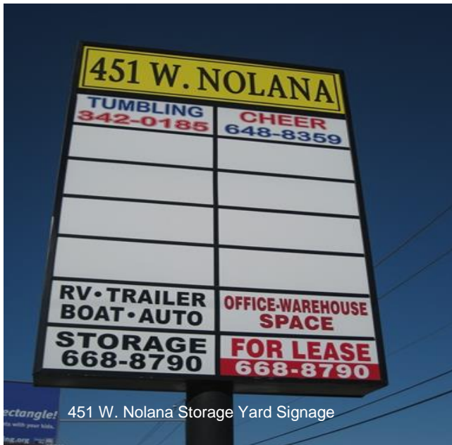
451 W. Nolana Storage Yard Signage