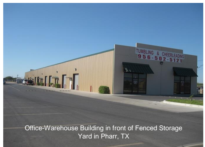
Office-Warehouse Building in front of Fenced Storage Yard in Pharr, TX

The information herein was obtained from sources believed reliable. However, Aztec Realty makes no guarantees, warranties or representations as to the completeness or accuracy thereof. The presentation of this property is subject to errors, omissions, change of price or conditions prior to sale or lease or withdrawal without notice. All areas and dimensions are approximate.