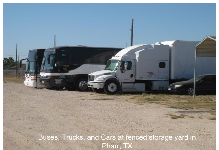
Buses, Trucks, and Cars at fenced storage yard in Pharr, TX