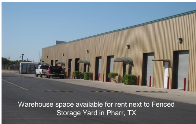
Warehouse space available for rent next to Fenced Storage Yard in Pharr, TX