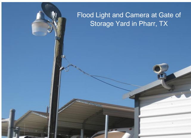
Flood Light and Camera at Gate of Storage Yard in Pharr, TX