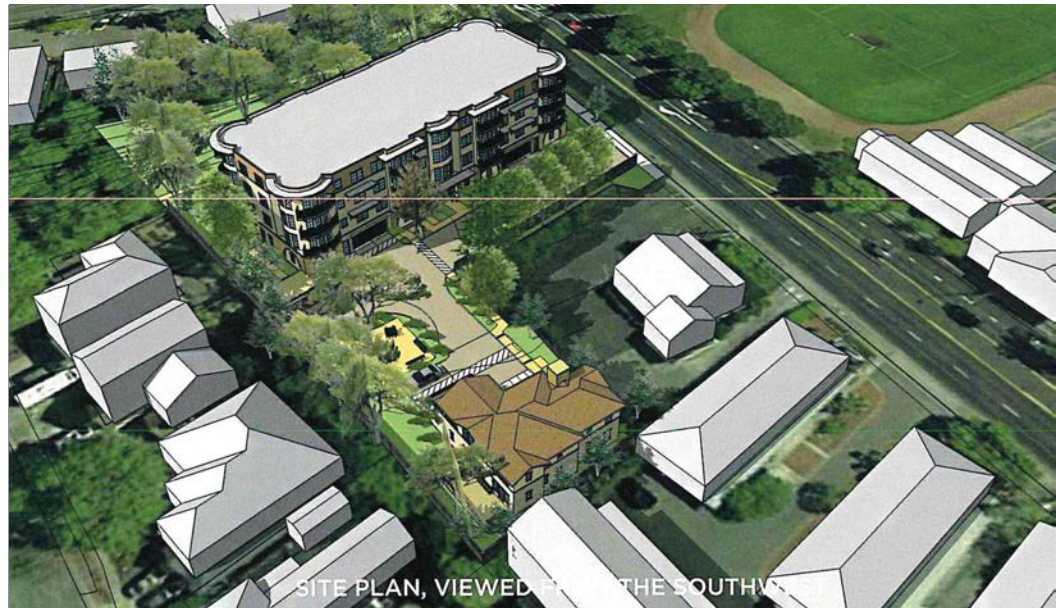
SITE PLAN, VIEWED FROM THE SOUTHWEST