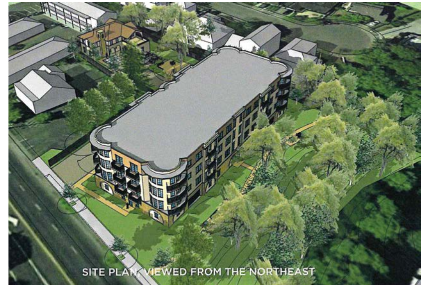
SITE PLAN, VIEWED FROM THE NORTHEAST