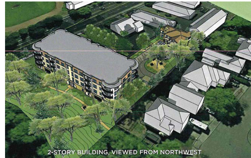
2-STORY BUILDING, VIEWED FROM NORTHWEST

PRESENTED BY: ANNETTE COOPER, SREA KEEGAN & COPPIN CO., INC. LIC # 00826250 (707) 528-1400 ACOOOPER@KEEGANCOPPIN.COM