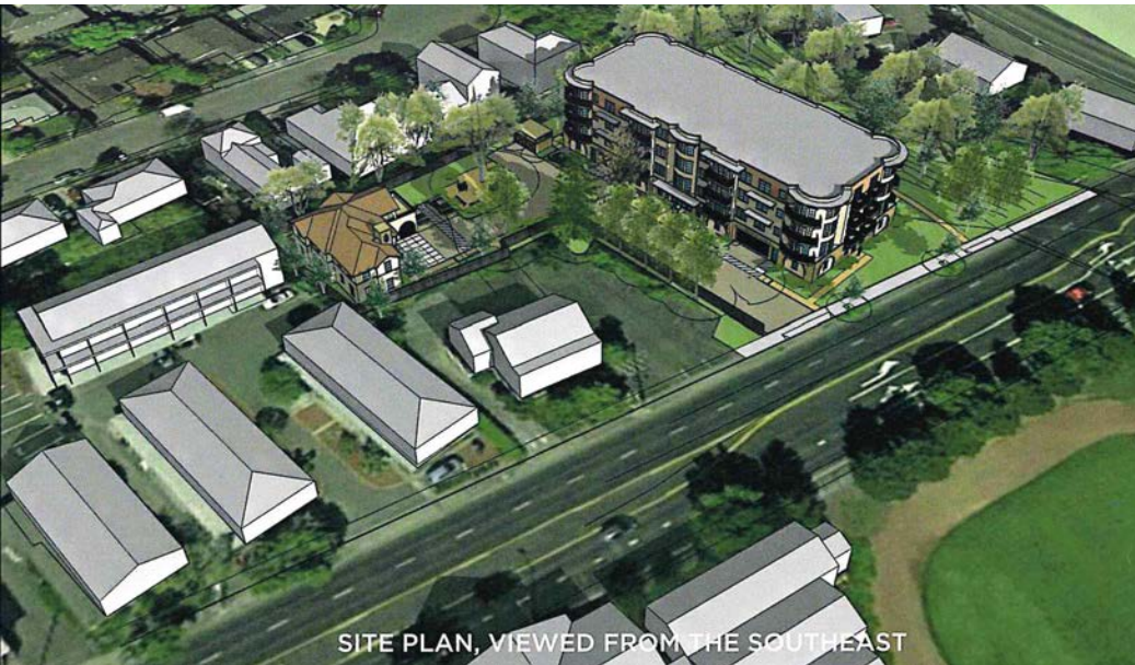
SITE PLAN, VIEWED FROM THE SOUTHEAST