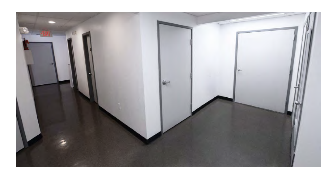
Hallway to Restrooms Studios Storage