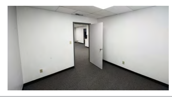
Expansive lobby, cabinets, storage closet, 3 offices, conference room