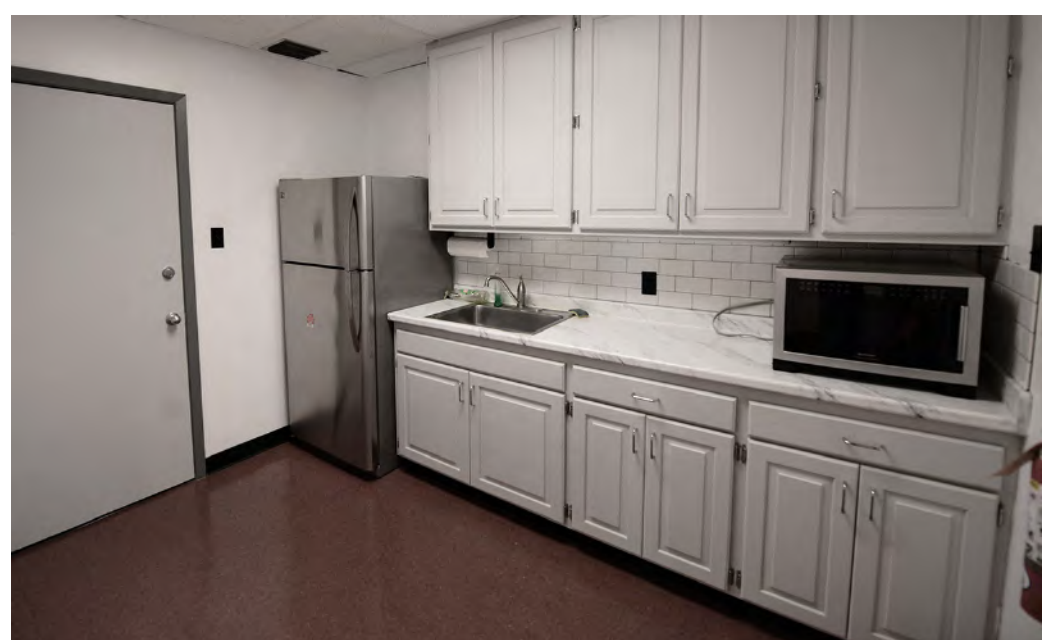
Second Floor Access