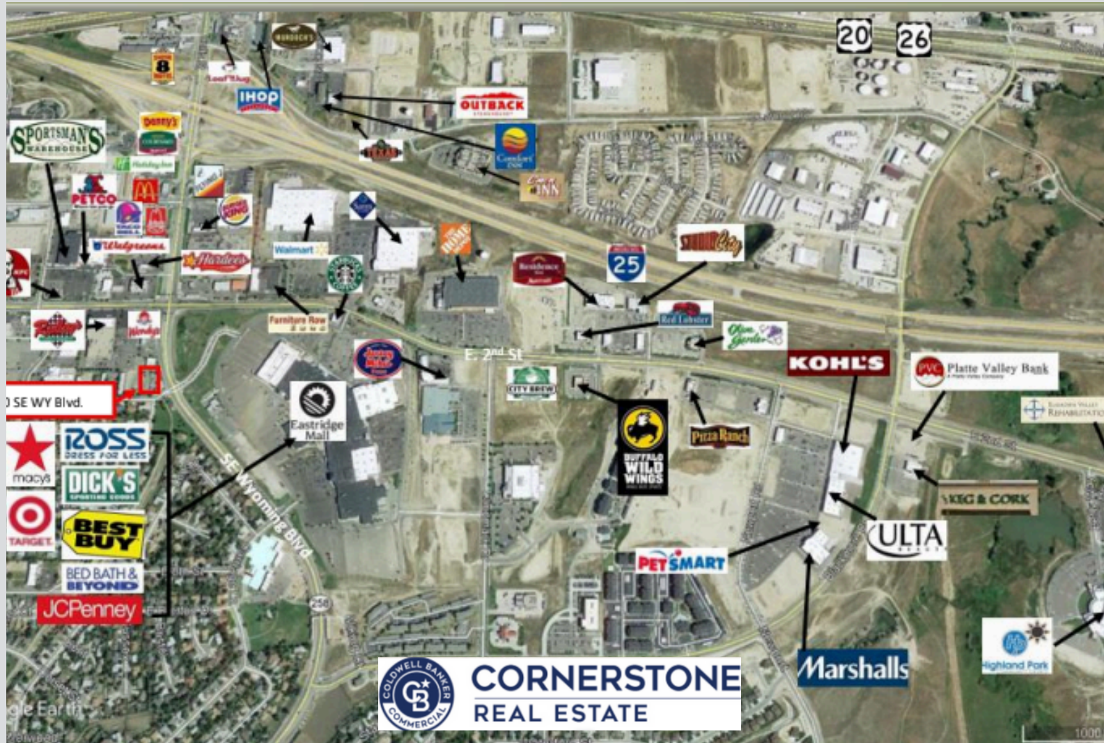
Aerial map of nearby businesses