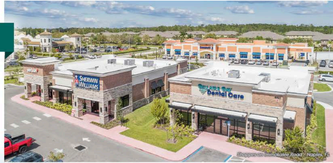
Shoppes on Immokalee Road - Naples, FL

Throughout the years, WMG has executed a solid track record of successful development solutions. WMG develops commercial real estate projects for a variety of industry segments, including retail, healthcare and restaurants. WMG Development is currently in 33 states and has more than 58 active projects. The company’s expertise in site selection, as well as its quick-action responsiveness, makes WMG Development the premier retail developer in the United States.