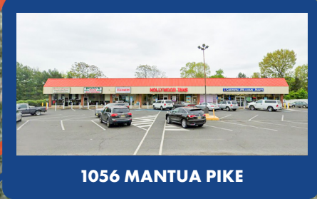
1056 MANTUA PIKE