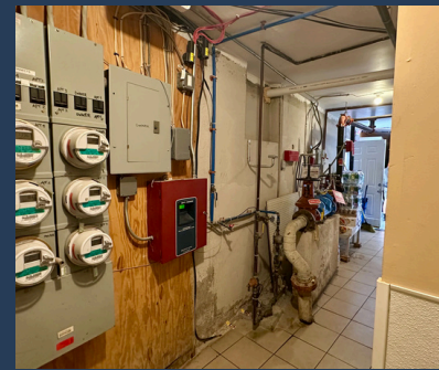
TOP: RESTAURANT LEFT TO RIGHT: APARTMENT & STORE