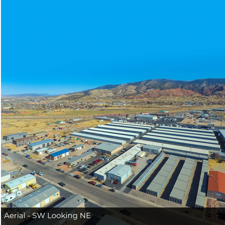
Aerial - SW Looking NE