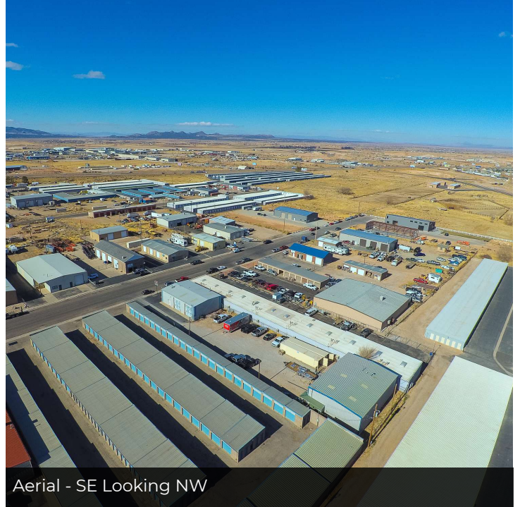
Aerial - SE Looking NW