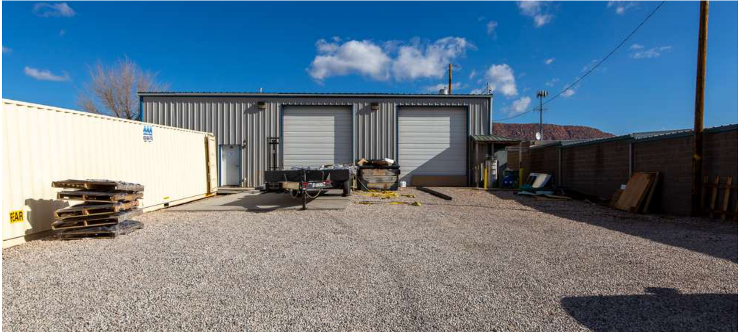
Rear Building - Available