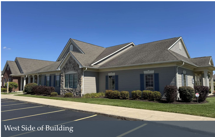
West Side of Building