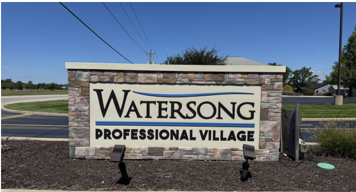
Visible Monument Signage Along Coldwater Rd.