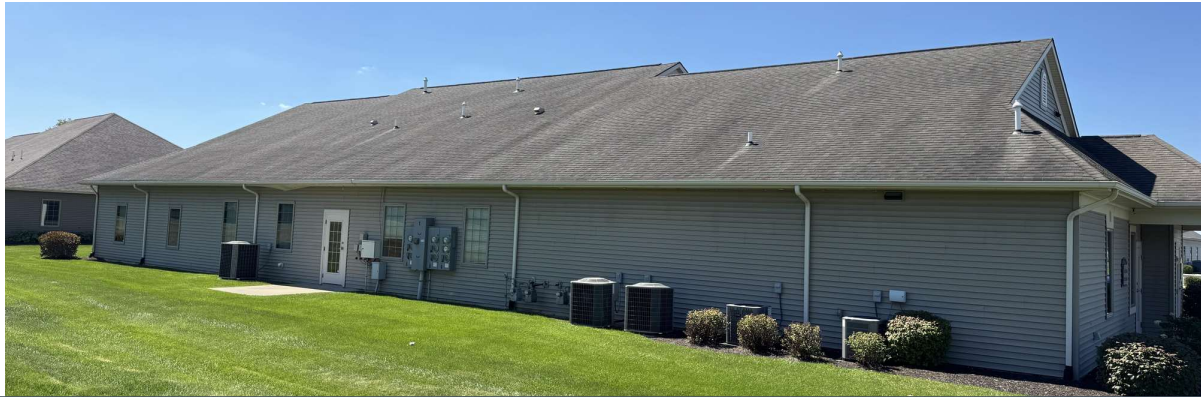
East Side of Building