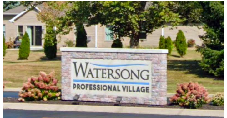
Visible Monument Signage Along Union Chapel Rd.