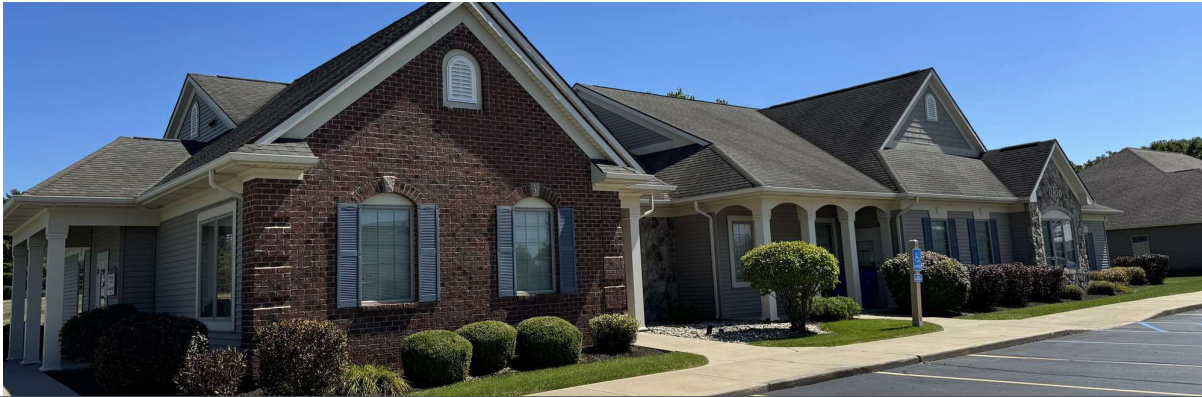
Front/West Side of Building/Total Building 6,205 SF