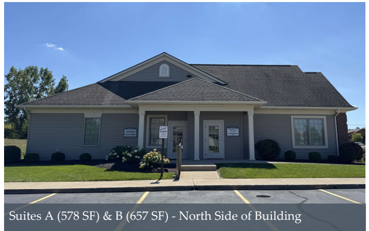
Suites A (578 SF) & B (657 SF) - North Side of Building