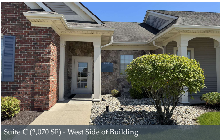
Suite C (2,070 SF) - West Side of Building