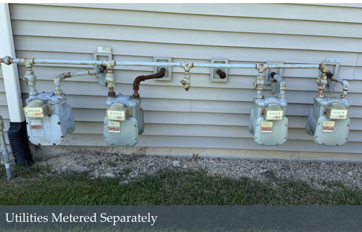
Utilities Metered Separately