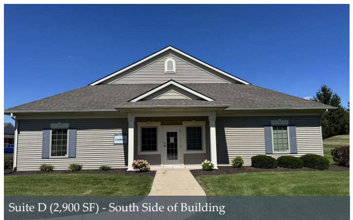
Suite D (2,900 SF) - South Side of Building