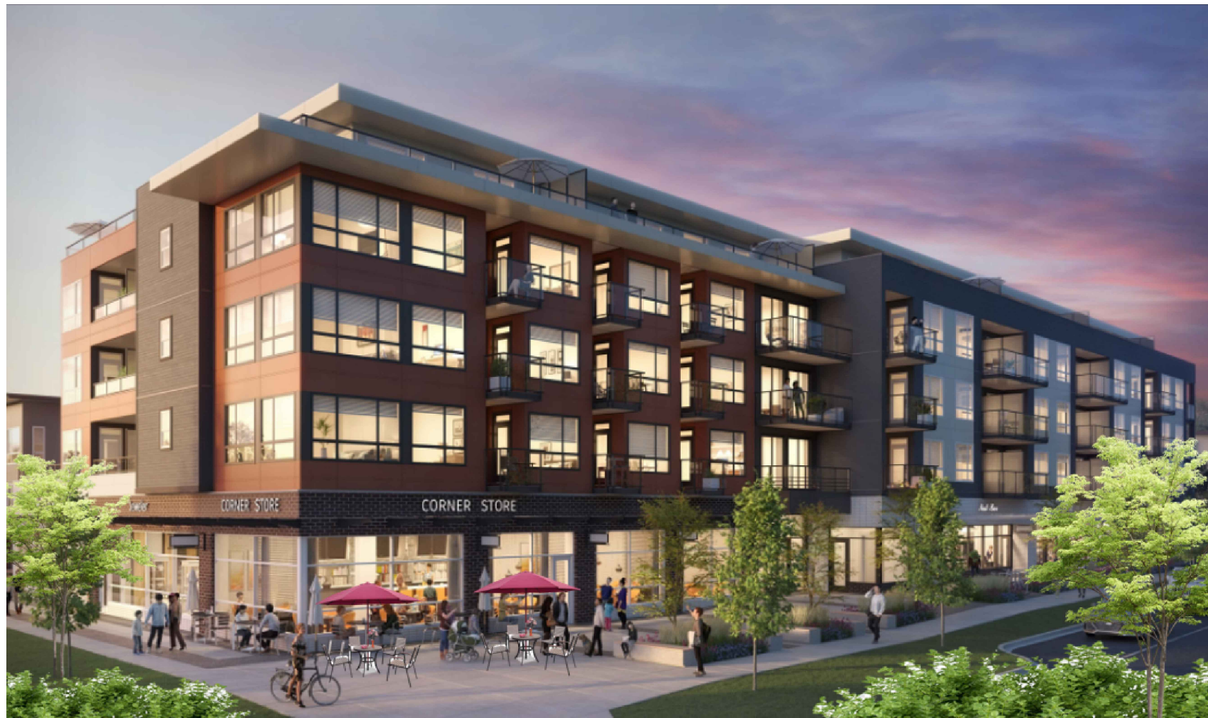
5 STORY VERTICALLY INTEGRATED MIX-USE

THE AWARD OF THE AWARD FOR ANY PERSON, FIRM, OR COMPANY FOR THE SERVICES OF AN ARCHITECT OR ENGINEER SHALL BE THE USER'S SOLE RESPONSIBILITY. THE ARCHITECT OR ENGINEER SHALL NOT BE RESPONSIBLE FOR THE USER'S USE OF THE DRAWINGS OR FOR THE USER'S FAILURE TO VERIFY THE EXISTING CONDITIONS AND CORRELATE DIMENSIONS PRIOR TO PROVIDING THE WORK DETAILED IN THESE DRAWINGS, AND SHALL PROMPTLY NOTIFY THE DESIGNER OF ANY DISCREPANCIES.