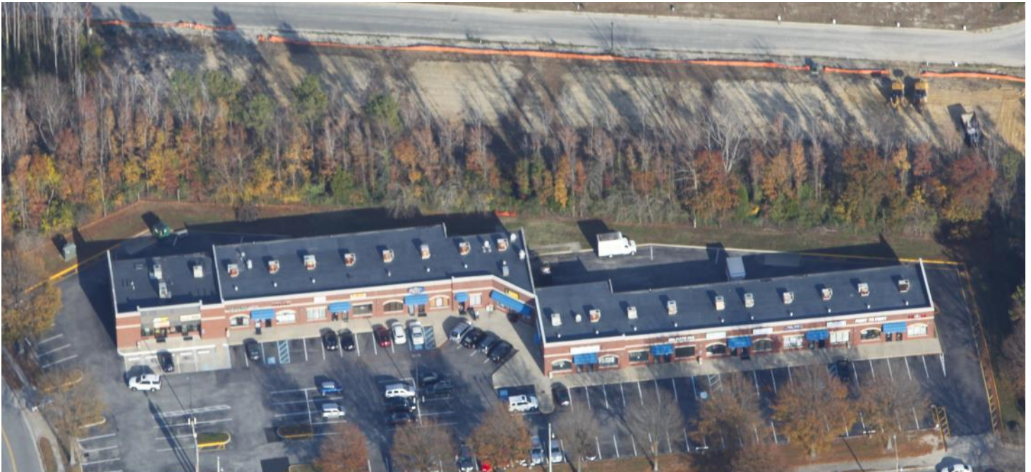
Diamond Springs Shoppes, Virginia Beach, VA