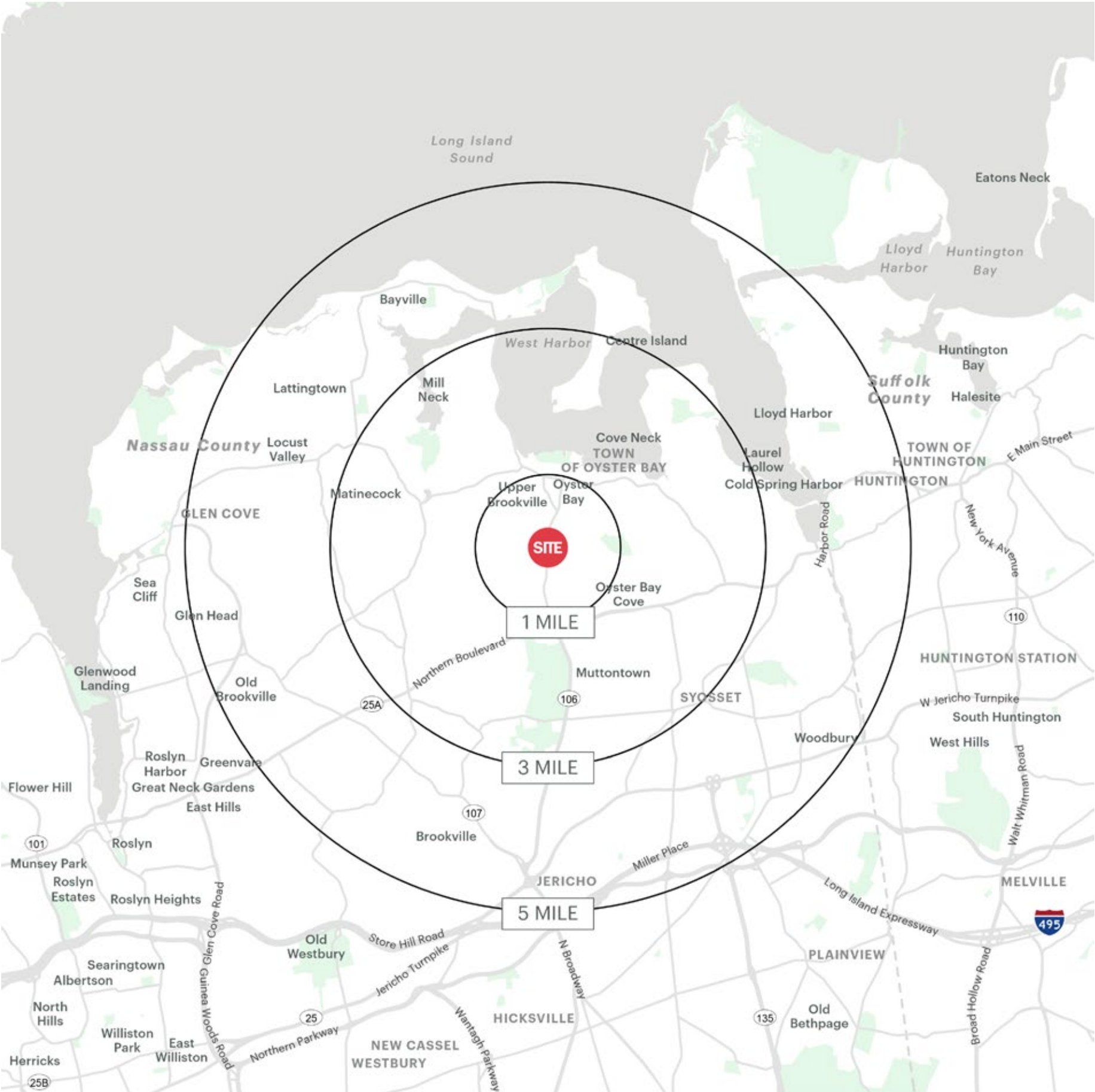
PINE HOLLOW SHOPPING CENTER OYSTER BAY, NEW YORK