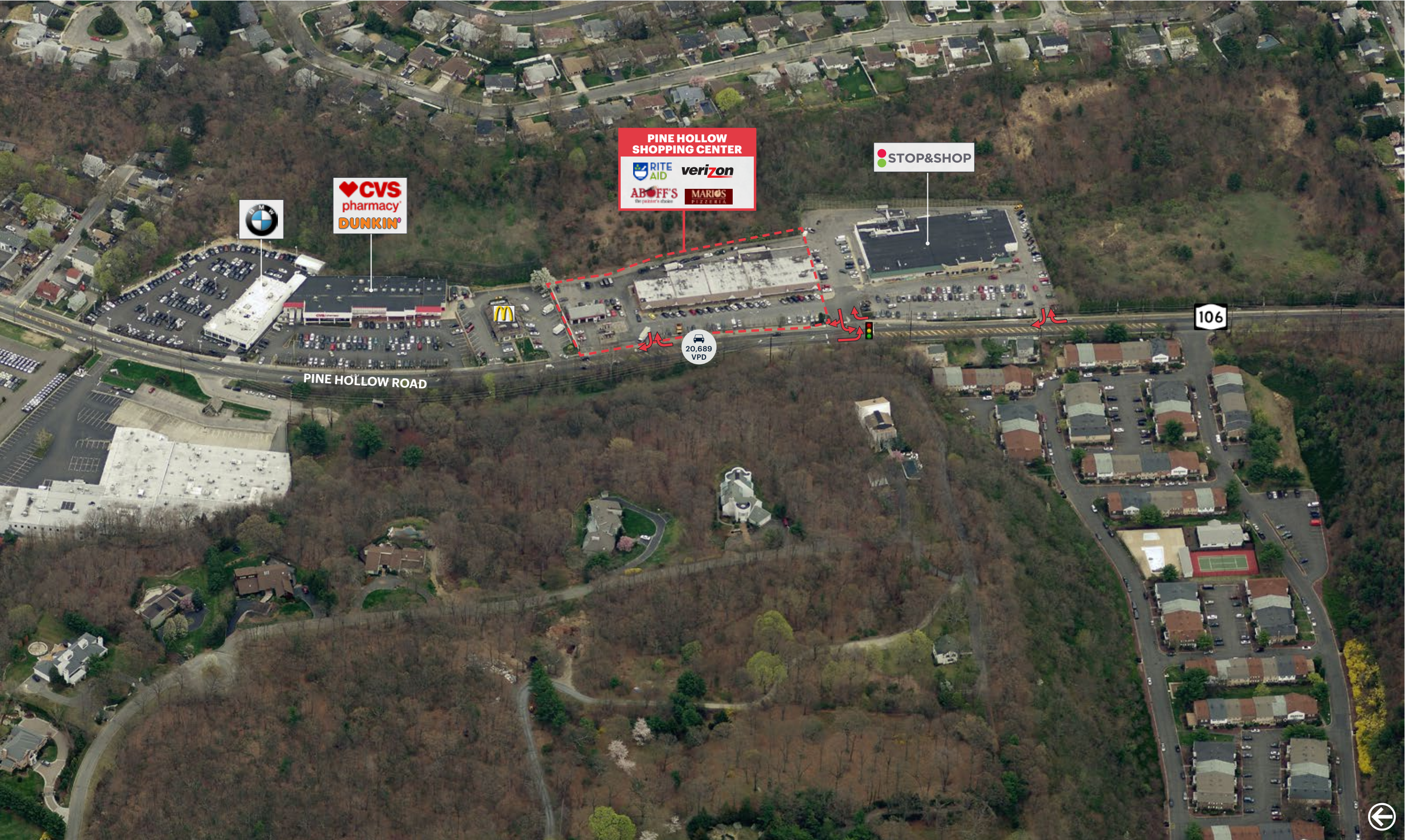
PINE HOLLOW SHOPPING CENTER OYSTER BAY, NEW YORK