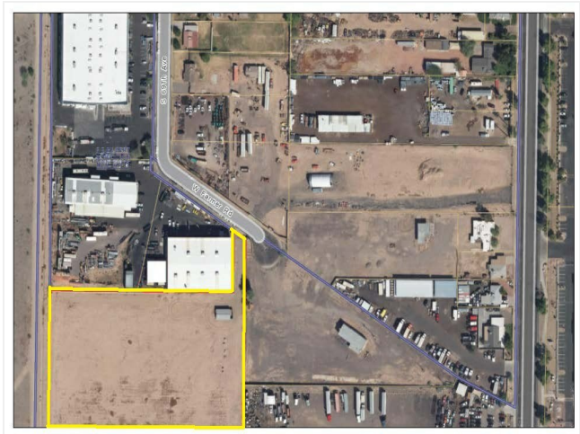
4.5 +/- ACRES (ZONED A-1)