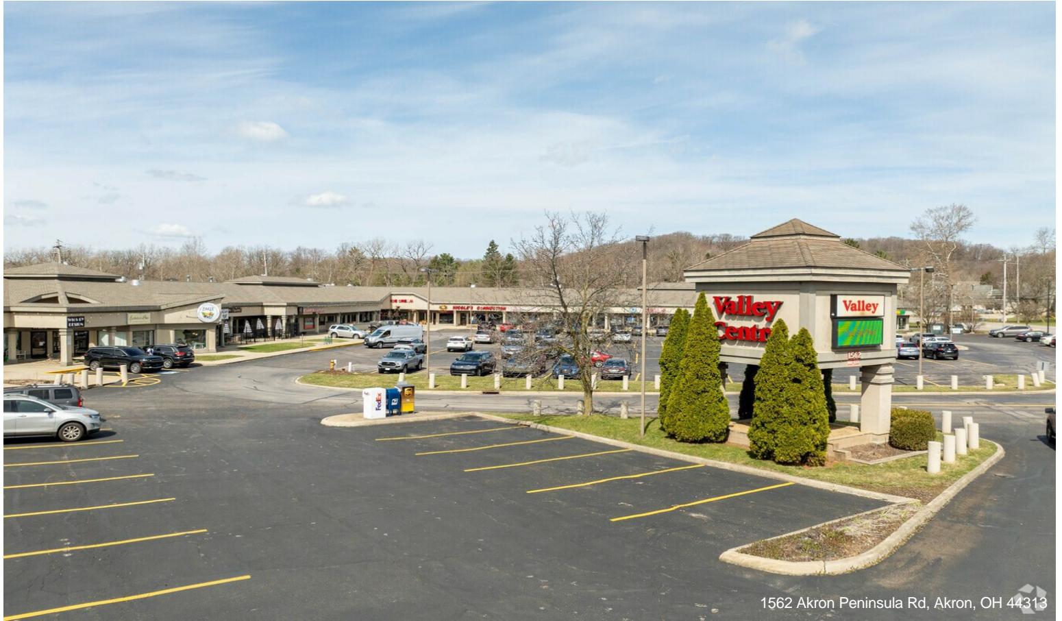
1562 Akron Peninsula Rd, Akron, OH 44313