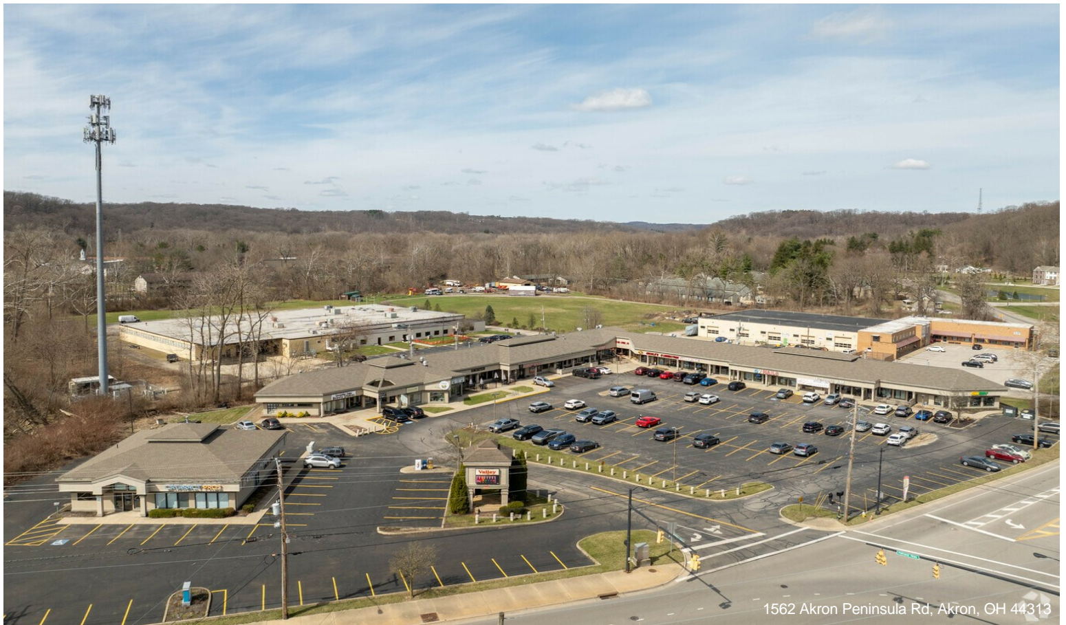
1562 Akron Peninsula Rd, Akron, OH 44313